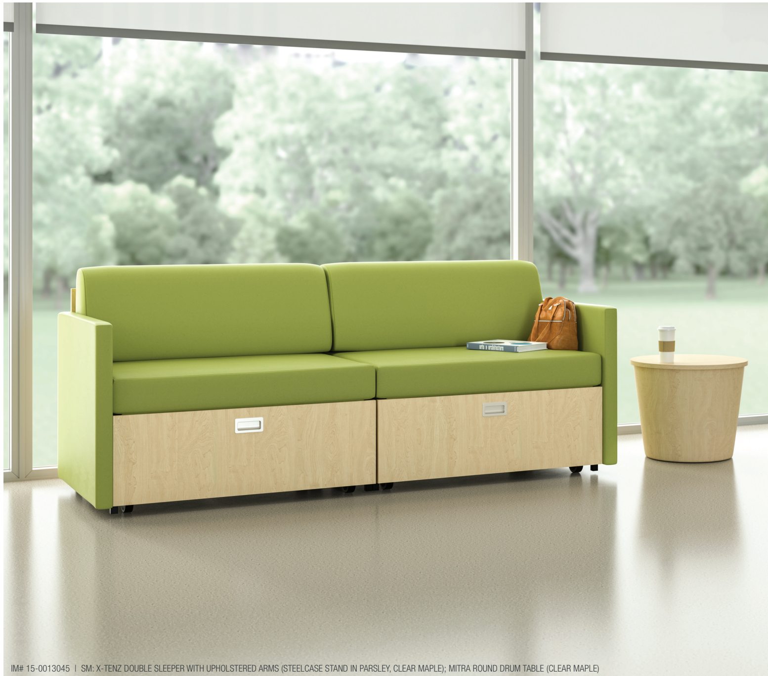
IM# 15-0013045 | SM: X-TENZ DOUBLE SLEEPER WITH UPHOLSTERED ARMS (STEELCASE STAND IN PARSLEY, CLEAR MAPLE); MITRA ROUND DRUM TABLE (CLEAR MAPLE)

Versatile and comfortable, X-tenz™ and Double X-tenz™ sleeper seating welcomes families in patient rooms, helping keep these supporters near the patient throughout the healthcare journey. By day, X-tenz provides seating and allows space for movement around the room. By night, it opens to provide a full-length sleeping surface. X-tenz is a smart solution for small spaces and underutilized areas, such as beneath a window or between columns. Optional casters for the single X-tenz add mobility to ease cleaning and room configuration.