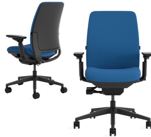
Amia® Chair Steelcase

Amia is an ergonomic task chair that blends sleek design with smart functionality. With intuitive manual adjustments, two back styles and dynamic support, Amia adapts to your needs and elevates any workspace.