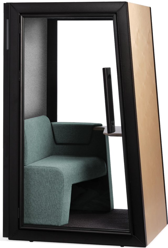
On the QT™ Orangebox

On the QT phone booths strike the balance between the need for efficient space and workable comfort — so you can take a video call, carry out focused work or simply think for a while.