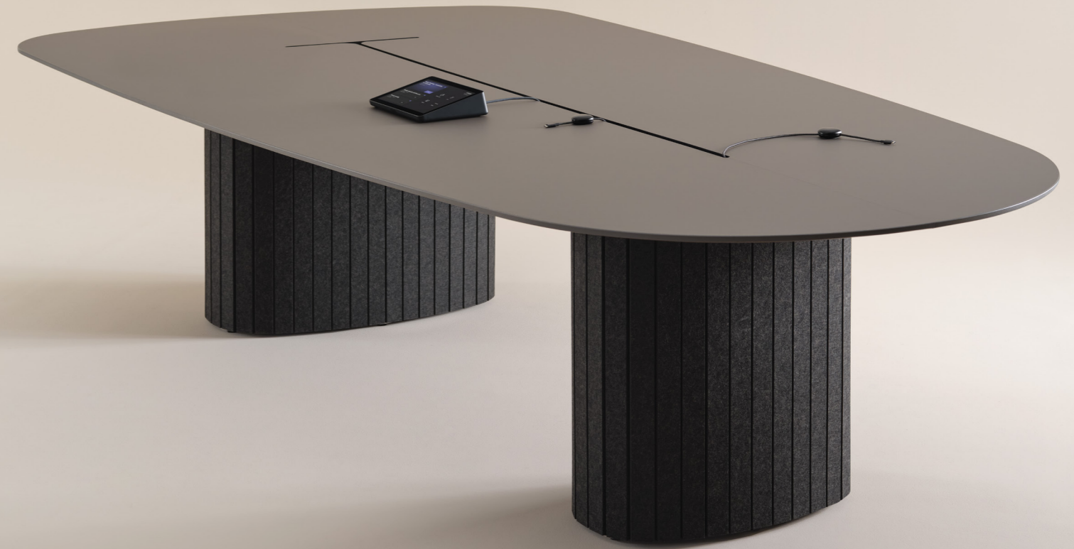
Ocular™ Sightline Table Steelcase

Engineered for dynamic environments, the Answer desk privacy panel provides customizable privacy and seamlessly adapts to evolving workspace requirements.