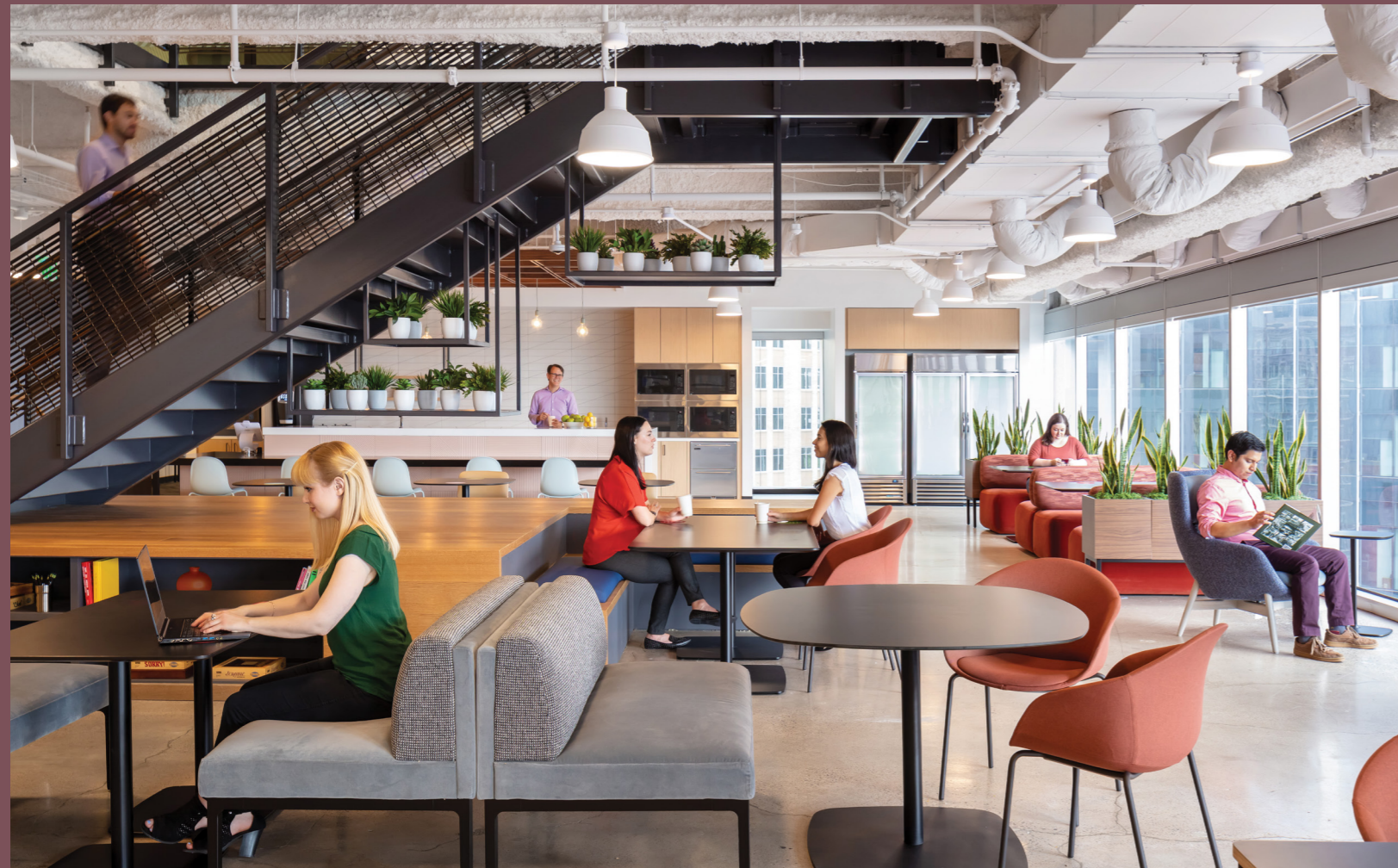
Biophilic elements, such as plants and natural light, create a welcoming backdrop in collaborative zones and support employee wellbeing.