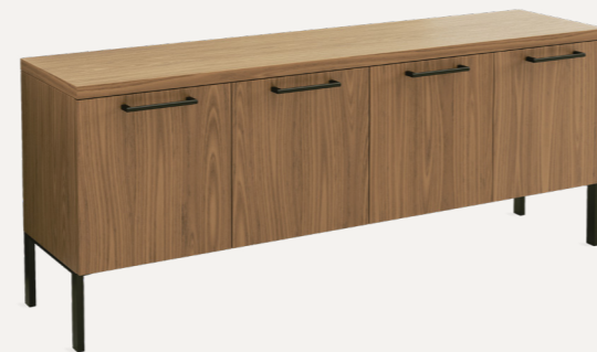
Elective Elements® Credenza Steelcase

A cozy, hospitality-inspired conference room features a Studio C1 table, leather chairs, warm finishes, Elective Elements storage, textured walls, and Moooi lighting — blending comfort, function, and elevated design in a welcoming, curated space.