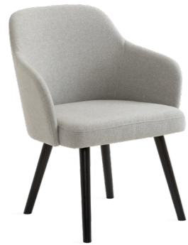
West Elm Work Sterling Collection West Elm