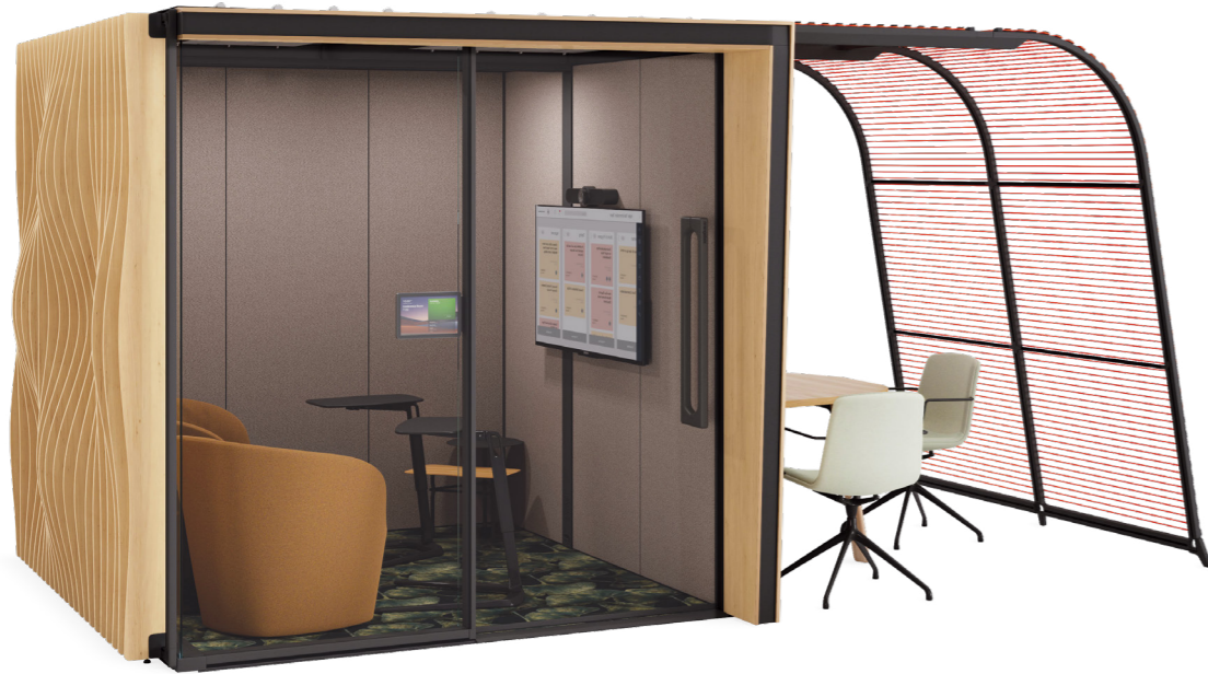
Campers & Dens Orangebox