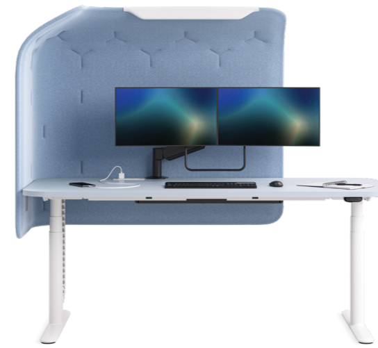
Migration™ Pro Height Adjustable Desk Steelcase