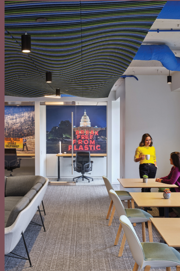
Consumers are prioritizing wellness by reducing exposure to toxins and choosing products that support long-term health and sustainability.

“Contract designers are stewards of societal transformation. Through inclusive, sustainable, and evidence-based design, they shape how communities live, work, heal, and learn — embedding equity, resilience, and belonging into the built environment.”