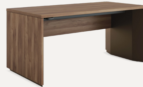
Slim Leg Height-Adjustable Desk Steelcase

This welcoming private office features a Slim Leg Height-Adjustable Desk with other refined products including storage, shelving, a custom coffee table, textured walls, and Moooi lighting — blending comfort, function, and elevated design in a curated space.