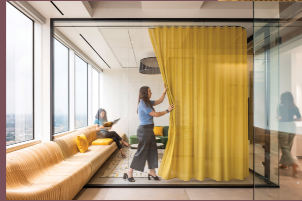
For a multigenerational workforce, flexible spaces such as hybrid rooms can transition to support different workstyles.

Contract interiors are evolving to meet rising expectations for health, inclusivity, and adaptability. Khoi Vo, CEO of ASID, shares insights from the Society's Trends and Economic Outlook reports, highlighting how neuro-inclusive design, AI integration, and adaptive reuse will shape spaces that foster wellness, flexibility, and measurable impact in a rapidly changing world.