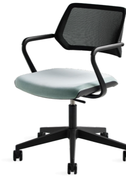
Qivi® Conference Chair Steelcase