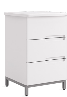
Park Bedside Table Steelcase Health

On the QT phone booths strike the balance between the need for efficient space and workable comfort — so you can take a video call, carry out focused work or simply think for a while.