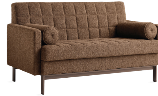
Millbrae Contract Lounge Sofa Coalesse