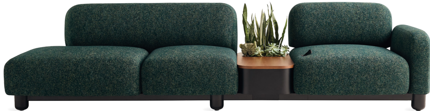
Coalesse Ensemble Lounge System Coalesse

Amia is an ergonomic task chair that blends sleek design with smart functionality. With intuitive manual adjustments, two back styles and dynamic support, Amia adapts to your needs and elevates any workspace.