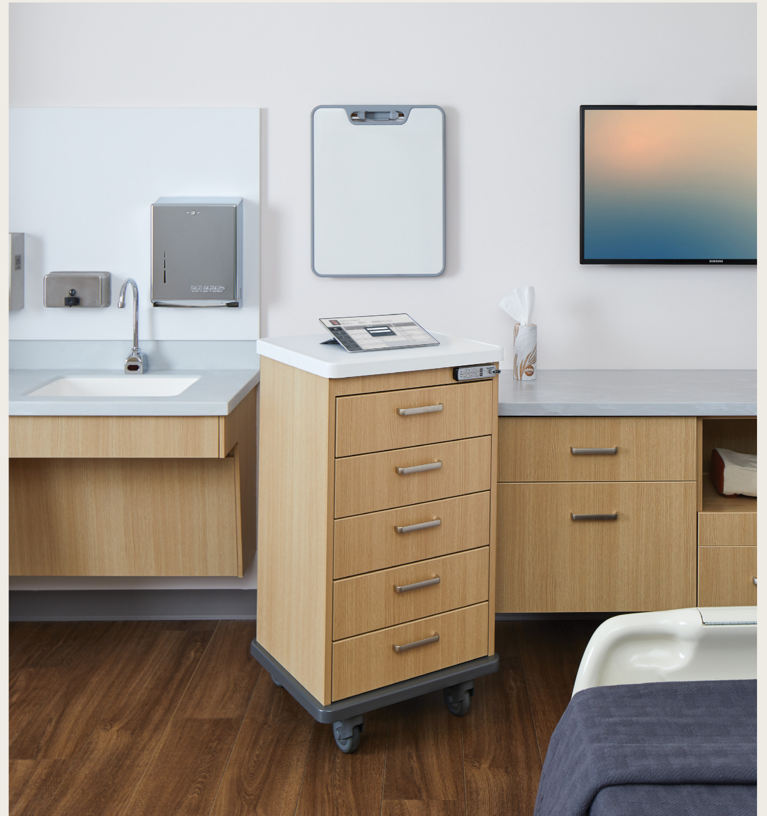
Currency® Storage Steelcase