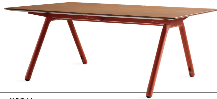
Potrero415 Table Coalesse