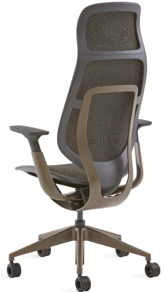
Steelcase Karman™ Chair with High Back Steelcase