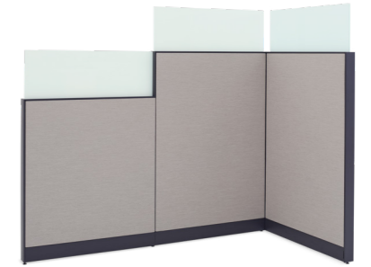
Answer® Panel Systems Steelcase

Engineered for dynamic environments, the Answer desk privacy panel provides customizable privacy and seamlessly adapts to evolving workspace requirements.