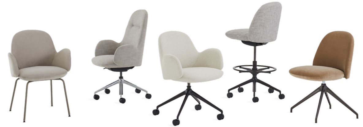
West Elm Work Kent Collection West Elm