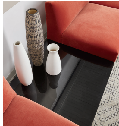
Mesa Sectional in W - Satsuma Mesa Coffee Table in Black Marble Veneer Horizon Nesting Table in Walnut, Black Marble and White Marble Veneers with Burnished Bronze Base

Our versatile Mesa sectional offers you and your team a space to re-energize, reconnect and find a fresh perspective during the workday. With deep seats and a supportive back, it's based on a square module for easy configurability.