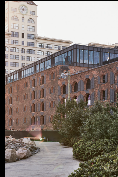
West Elm's Brooklyn Headquarters

"We're powered by a passion for design and putting people first, as well as an understanding of how people live and work."