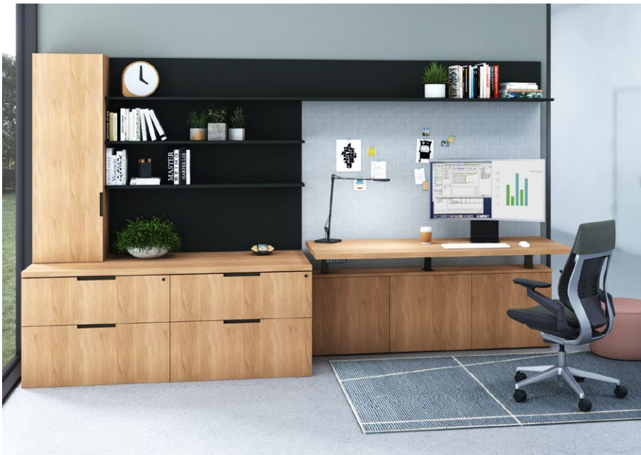
Wall-mount straight height-adjustable desk 30"D x 72"W