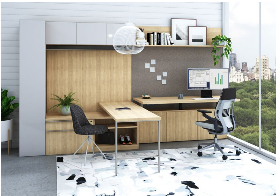
Wall-mount straight height-adjustable desk 30"D x 60"W