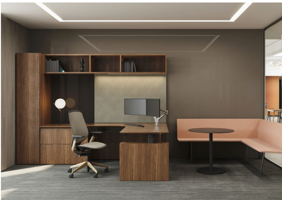
Wall-mount corner height-adjustable desk 30"DL x 54"WL x 30"DR x 84"WR