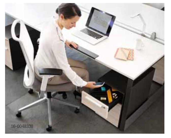
EFFICIENT ORGANISATION Pen trays and interior drawer dividers keep tools at hand and free up space on the worksurface.

Volum Art combines a family of products with robust performance, providing planning flexibility and easy integration with other Steelcase components.