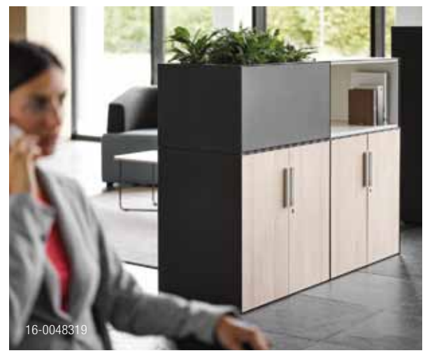
Add natural inspiration and enhance space separation with a niche option for plants on Volum Art storage.