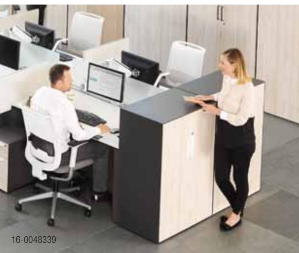
Standing height cabinets support impromptu discussion and collaboration.