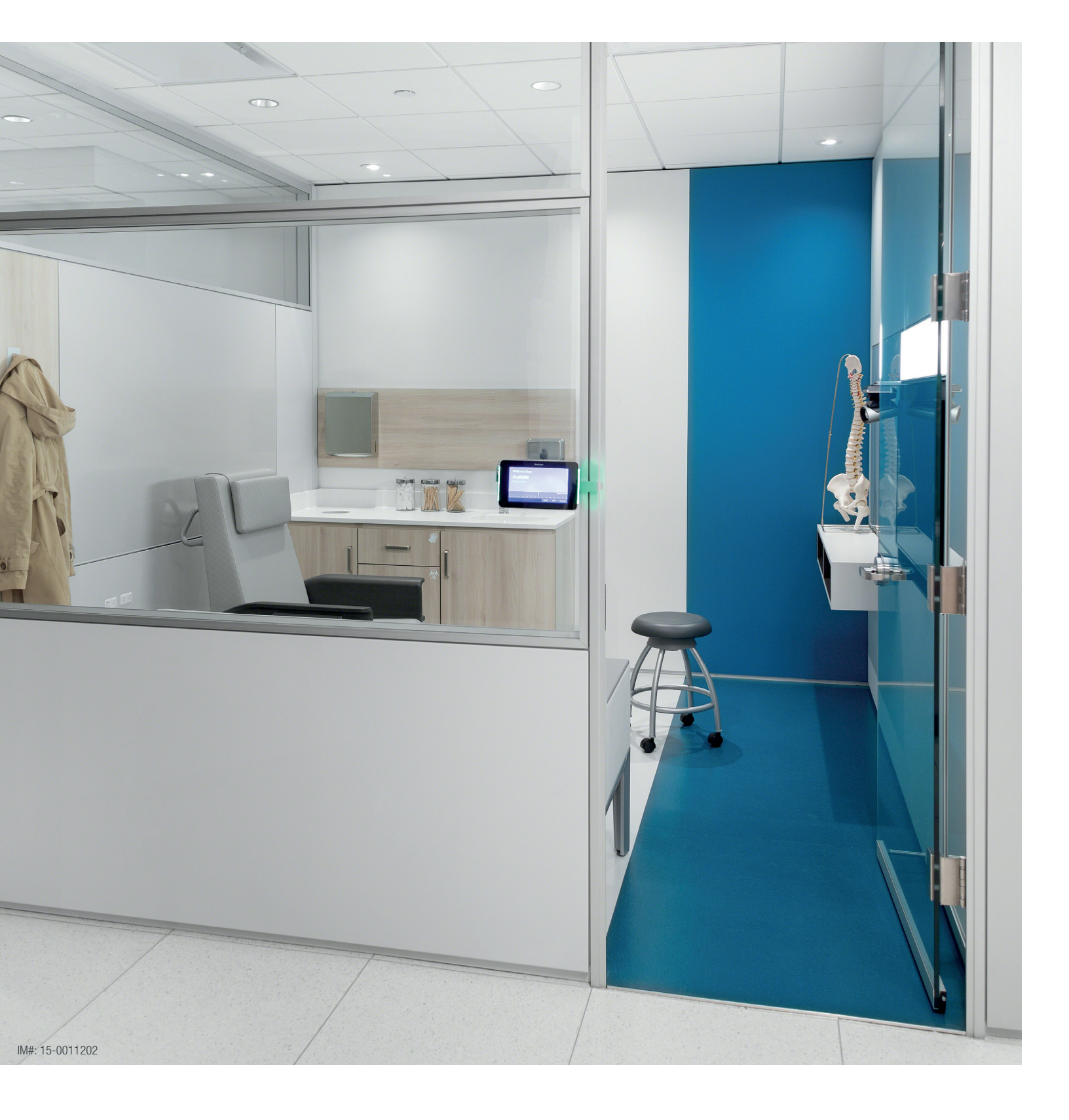
V.I.A. ™ for healthcare