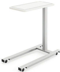
36”H Rectangular Top, U-Base