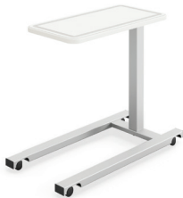
30”H Rectangular Top, U-Base

Simple to move and easy to clean, fixed-height overbed tables provide three convenient surface levels for use with beds, patient seating, or as a clinician worksurface. Featuring a mobile, low-profile U-base and rectangular thermoform top with built-in spill edge, these overbed tables help give patients a sense of control over personal belongings and clinicians a place for care essentials while attending to patient needs.