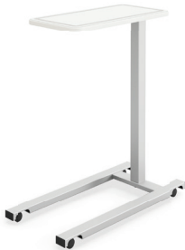
42”H Rectangular Top, U-Base