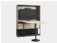
Media Tower, 5-High (Internal mount with standing height table)