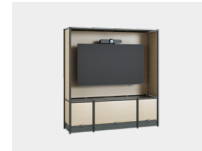
Media Tower, 4-High (Internal mount)