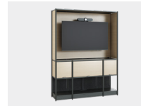
Media Tower, 5-High (Internal mount)