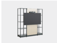
Media Tower, 4-High (External mount)