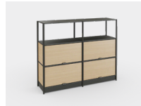
End of Run