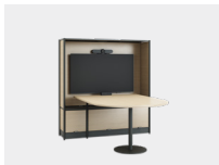
Media Tower, 4-High (Internal mount with seated height table)