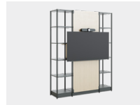
Media Tower, 5-High (External mount)