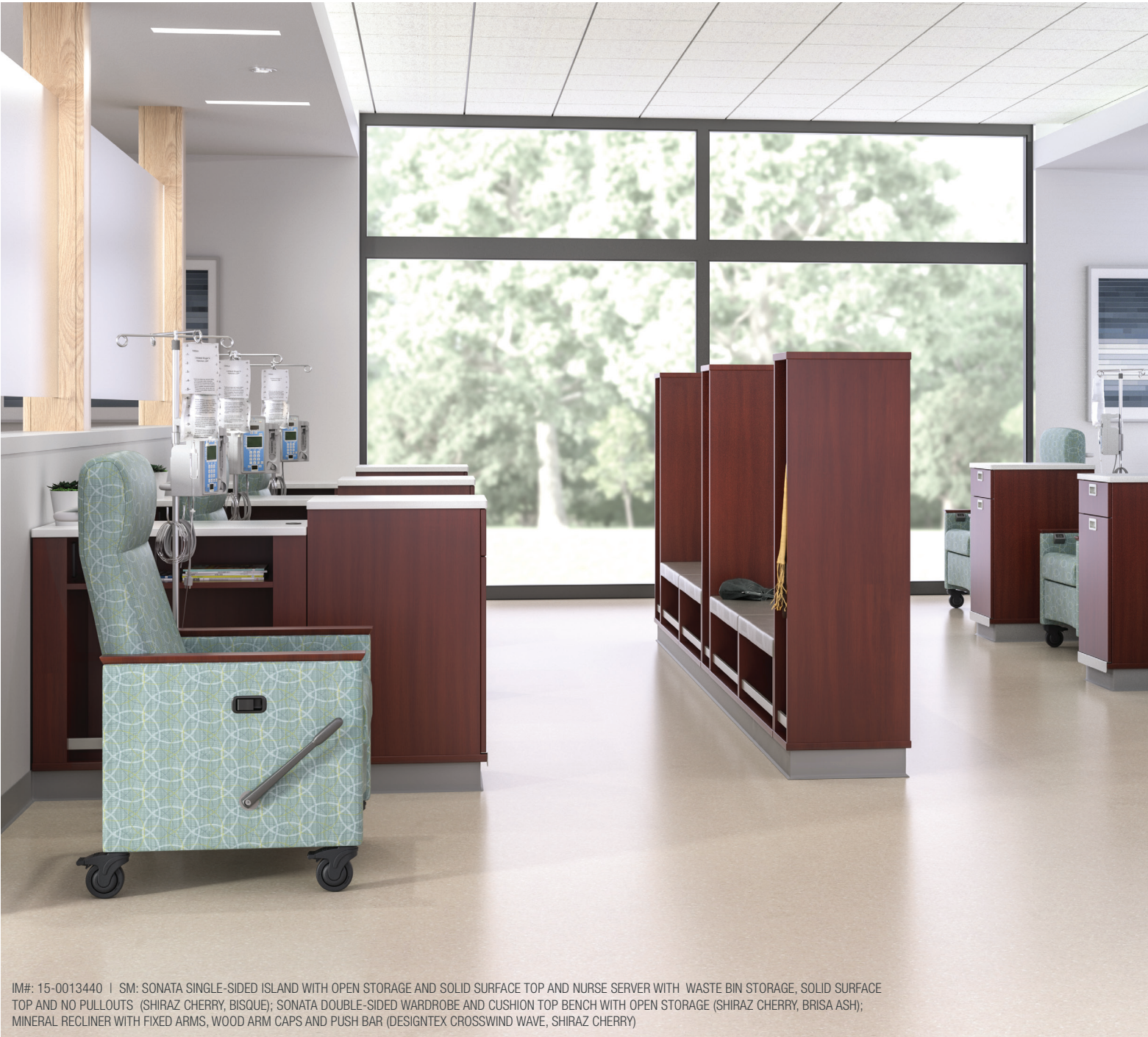
IM#: 15-0013440 | SM: SONATA SINGLE-SIDED ISLAND WITH OPEN STORAGE AND SOLID SURFACE TOP AND NURSE SERVER WITH WASTE BIN STORAGE, SOLID SURFACE TOP AND NO PULLOUTS (SHIRAZ CHERRY, BISQUE); SONATA DOUBLE-SIDED WARDROBE AND CUSHION TOP BENCH WITH OPEN STORAGE (SHIRAZ CHERRY, BRISA ASH); MINERAL RECLINER WITH FIXED ARMS, WOOD ARM CAPS AND PUSH BAR (DESIGNTEX CROSSWIND WAVE, SHIRAZ CHERRY)

All components are available in both single- and double-sided styles. A common base routes utilities and seals to the floor to facilitate cleaning.