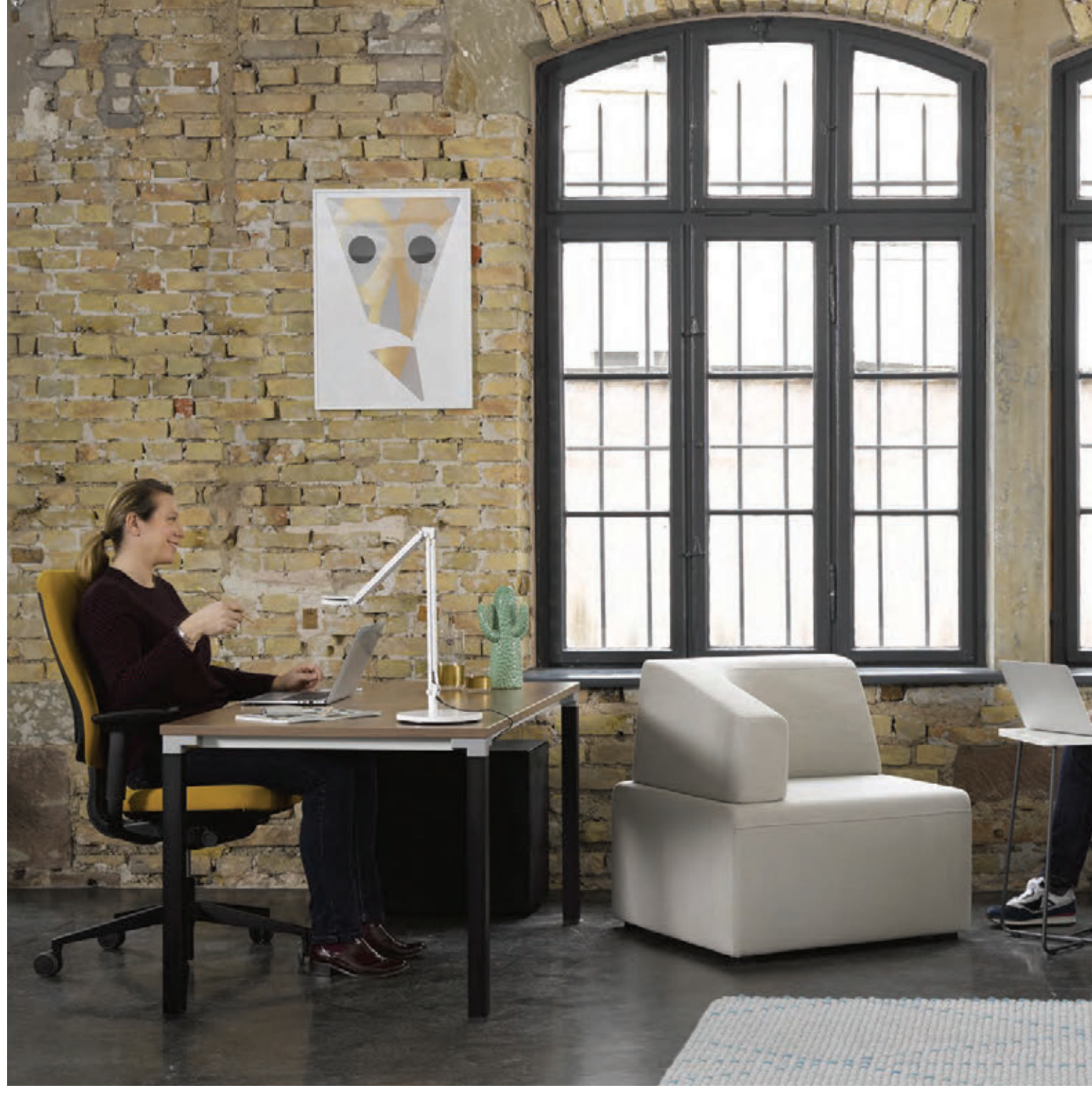
D1506 | REPLY AIR TASK CHAIR (TR03, AIR 03), REPLY TASK CHAIR (TR07), KALIDRO DESK (W5,SL), B-FREE BIG CUBES (TR03), B-FREE SMALL CUBES (TR07)