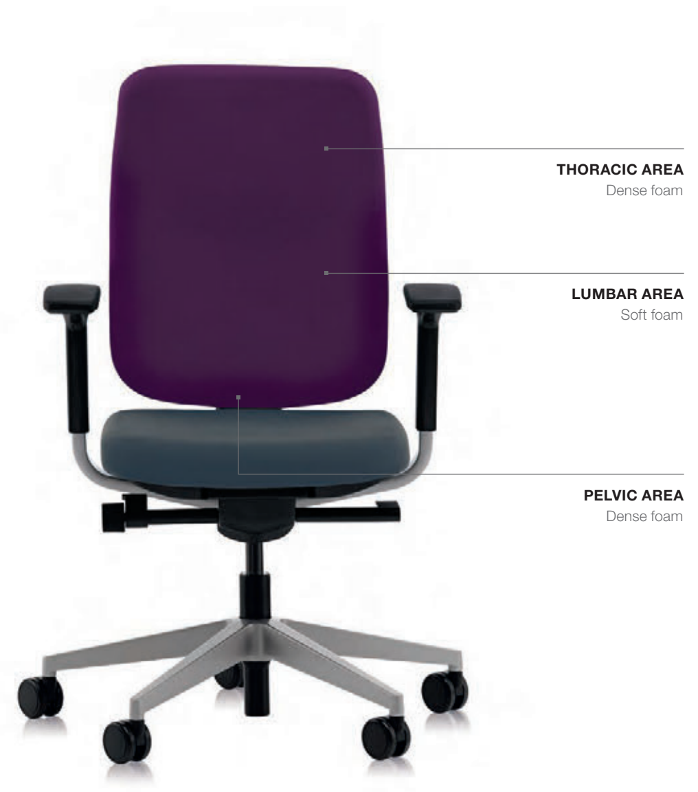
Reply task chair offers a classic and sleek design to the workplace. The upholstered version comes in merle and black finishes.