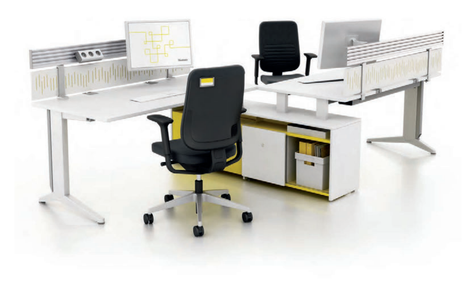
C7942 | FUSION SW, LEG ZW, STORAGE ZW/JA, REPLY AT04, PARTITO RAIL RO/SW/DB44

Steelcase has created Reply and Reply Air. A family of customised, high-performance seating which combines choice of aesthetic with real comfort and an easy to use ergonomic design.