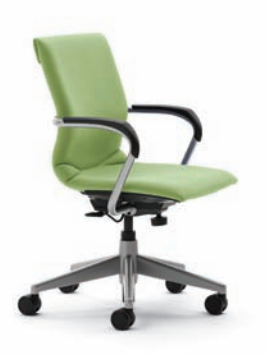
Work Chair Platinum Swivel Base Full Adjustability