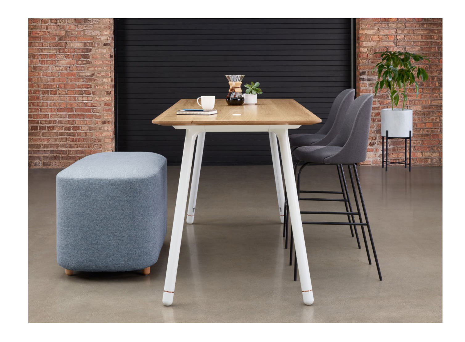
— Customize the frame, metal legs and leg rings with infinite color through Coalesse Color.