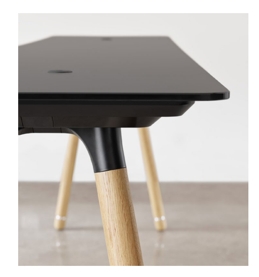
Choose laminate, veneer, Corian or glass top materials — or customize through the Coalesse Pattern and Coalesse Material Capabilities programs.

Make your mark with distinct design details — rich top and leg materials, leg rings, and stitching details. Wood legs bring quintessential warmth and character to enhance a workspace and evoke positive emotional connections.