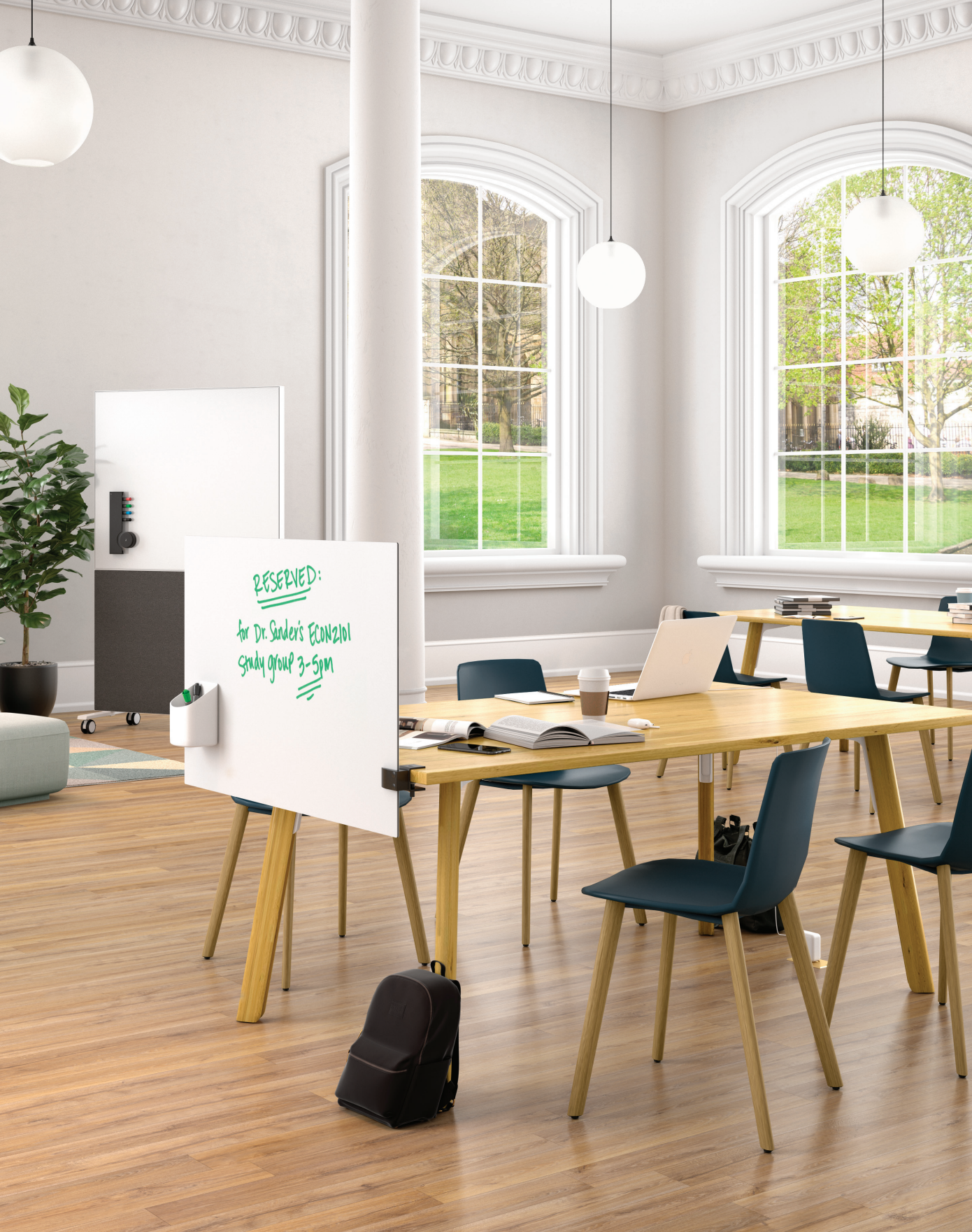
Arctic White Gloss in the Privacy / Modesty Setup