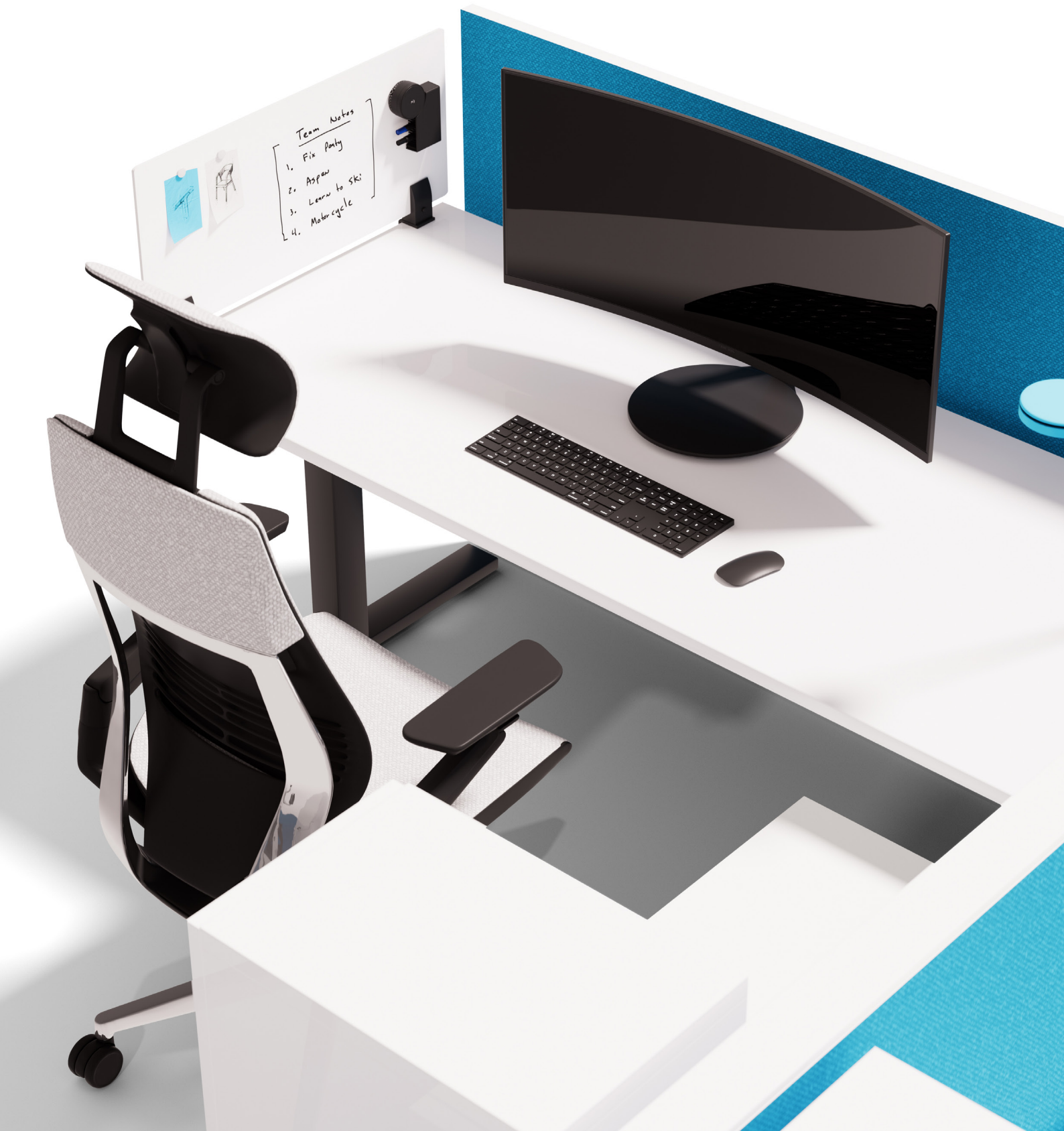
Arctic White Side Divider / Top Mount Setup