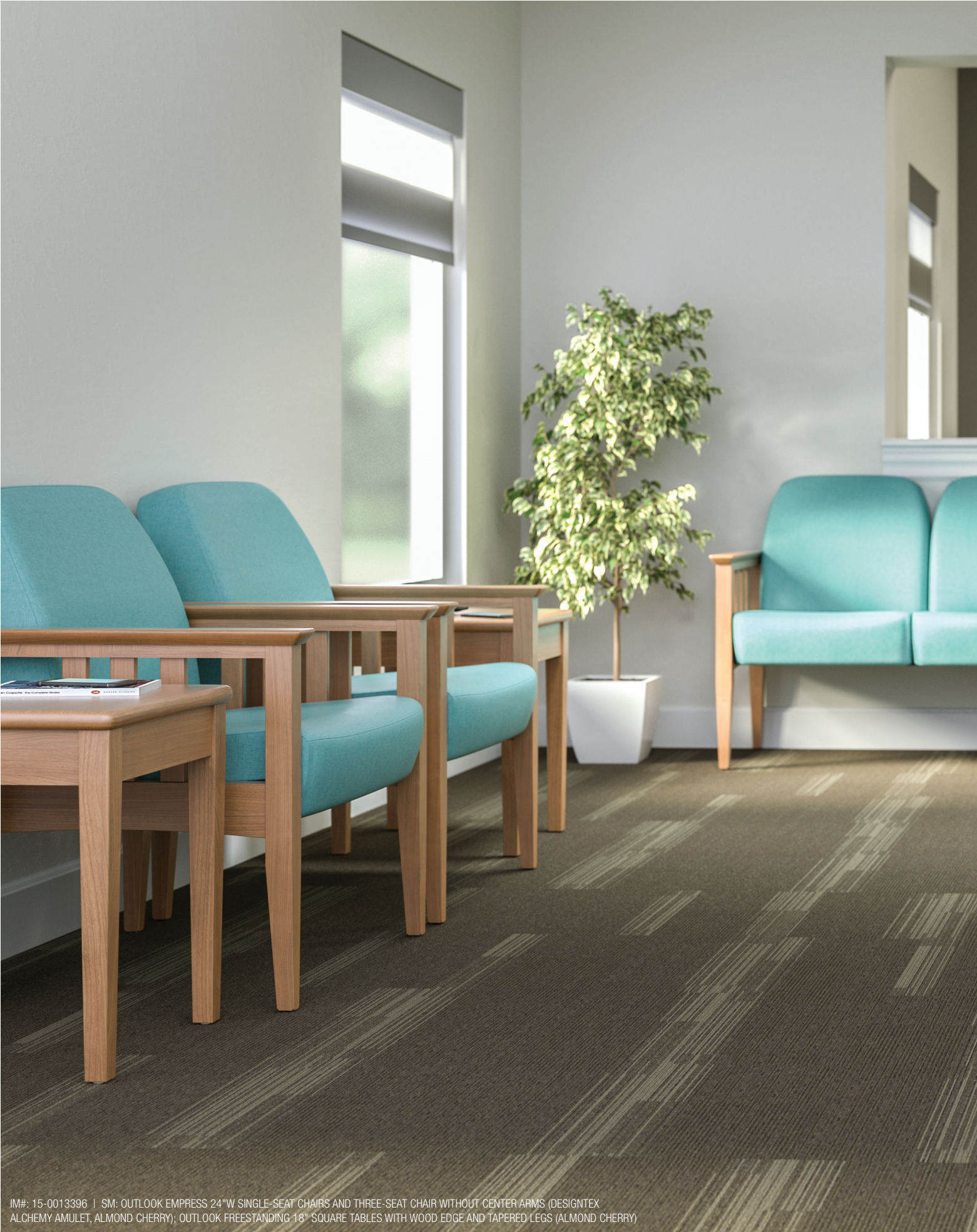
IM#: 15-0013396 | SM: OUTLOOK EMPRESS 24"W SINGLE-SEAT CHAIRS AND THREE-SEAT CHAIR WITHOUT CENTER ARMS (DESIGNTEX ALCHEMY AMULET, ALMOND CHERRY); OUTLOOK FREESTANDING 18" SQUARE TABLES WITH WOOD EDGE AND TAPERED LEGS (ALMOND CHERRY)