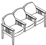
Three-seat with center arms