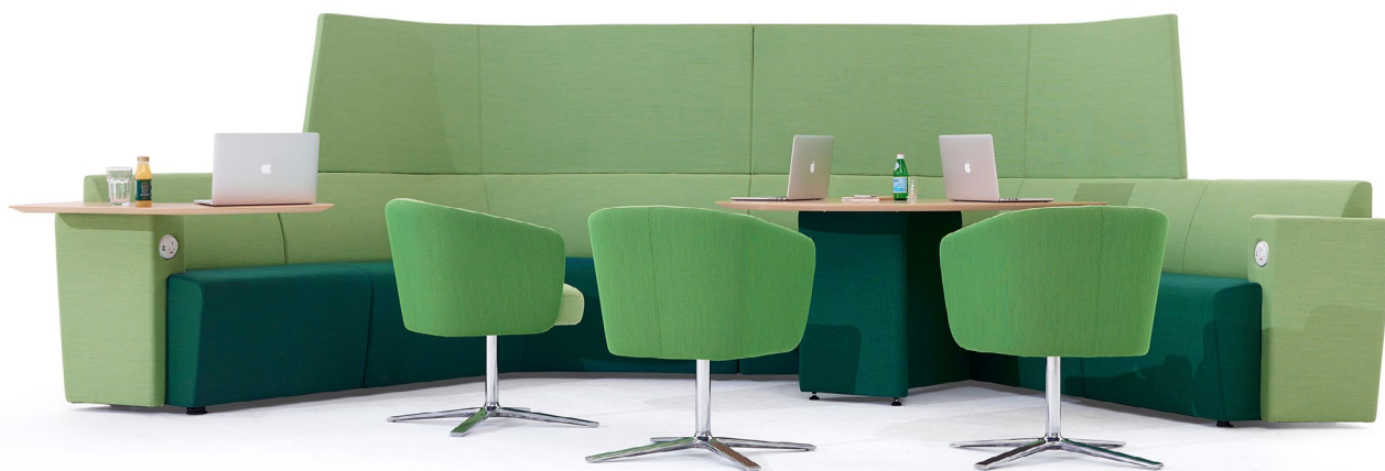
Top - HY-03, Bottom - HY-03