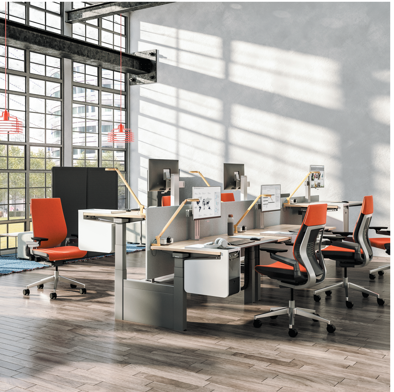
Ology Height-Adjustable Bench