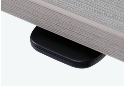
Simple Touch controller

Ology's Simple Touch controller allows users to effortlessly move the desk up or down without taking their eyes off their work, while Active Touch reminds workers to change posture with Active Motion, subtle desk movements that remind users to maintain posture. Users create a profile with preset desk heights and preferred intervals of sitting and standing, and the Bluetooth-enabled controller seamlessly pairs with the Rise mobile app so users can take their presets with them and track their level of activity over time.