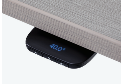
Active Touch controller

Optional antimicrobial treatment available