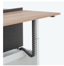
Perpendicular Cable Manager