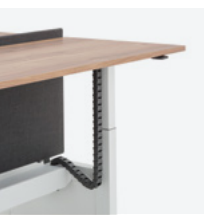
Perpendicular Cable Manager

Privacy options: • Infills • Boundary screens • FrameOne end panels