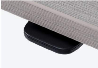
Simple Touch controller

Ology's Simple Touch controller allows users to effortlessly move the desk up or down without taking their eyes off their work, while Active Touch reminds workers to change posture with Active Motion, subtle desk movements that remind users to maintain posture. Users create a profile with preset desk heights and preferred intervals of sitting and standing, and the Bluetooth-enabled controller seamlessly pairs with the Rise mobile app so users can take their presets with them and track their level of activity over time.