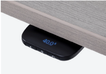
Active Touch controller

Optional antimicrobial treatment available