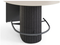
Foot Rail (Standing only)