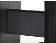
Tech Channel Cover