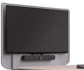
Monitor Shroud (optional)