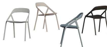
LessThanFive Essential Series