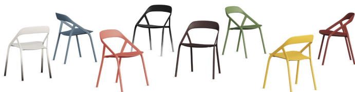
LessThanFive Chair, shown in standard finishes.