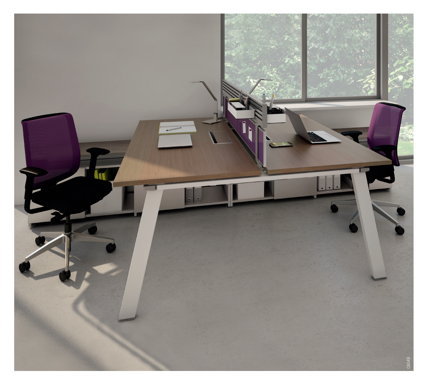
Fusion Bench for 2 with Solo Storage / Cable tray / Top access / Partito rail / Worktools 1+1 / 1+1 LED Standard lamp / Reply Air task chair.

Fusion Bench encourages and facilitates collaborative working whilst at the same time enabling people to stay focused on their work. Individually or shared Storage solutions integrated into the structure help optimise space. Power and data is easily and quickly accessible in the desk. Thanks to its contemporary shape, its simplicity and flexibility, Fusion Bench makes it easy to build larger configurations in team or individual spaces without compromising valuable square metres.