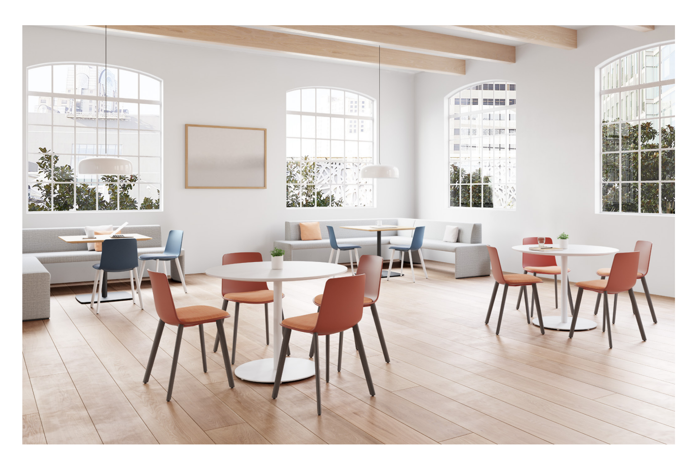
Altzo943 features a natural palette for a wider range of seat shell colors. Designers will enjoy more freedom of expression with mixed material and color combinations, to make social seating that's as alluring in style as it is in comfort.