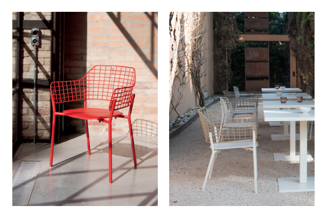
Shown with EMU Round