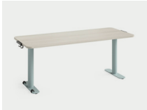
Large 30"D x 48, 60, 66, 72, 84"W