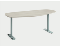
Group 32"D x 72"W