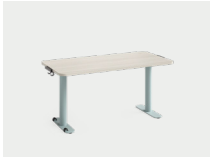
Medium 24"D x 48, 60, 66, 72, 84"W