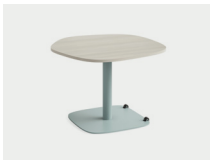
Huddle 42"D x 42"W