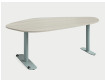
Collaborative 46"D x 84"W