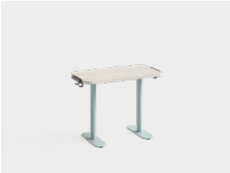
Small 19" D x 34, 48, 60, 66, 72, 84"W