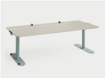
Extra Large 42"D x 48, 60, 66, 72, 84, 90"W