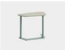
Personal 19"D x 35"W

Available in lounge (26"), seated (28.5"), and standing (38.5") heights, Elbrook tables are designed to encourage student movement and foster the natural flow of learning throughout the classroom. A variety of worksurface shapes and recessed legs allow for ease of collaboration.