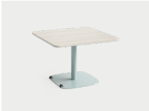
SQUARE 34, 36, 38, 42, 48"W