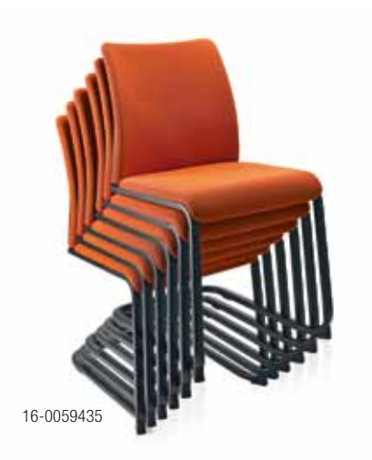
Eastside is stackable up to 6 chairs in 4-legs and sled base versions.

Eastside is excellent for optimising space use as it can be stacked and stored effortlessly.