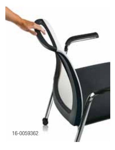
With handle for easy movement.