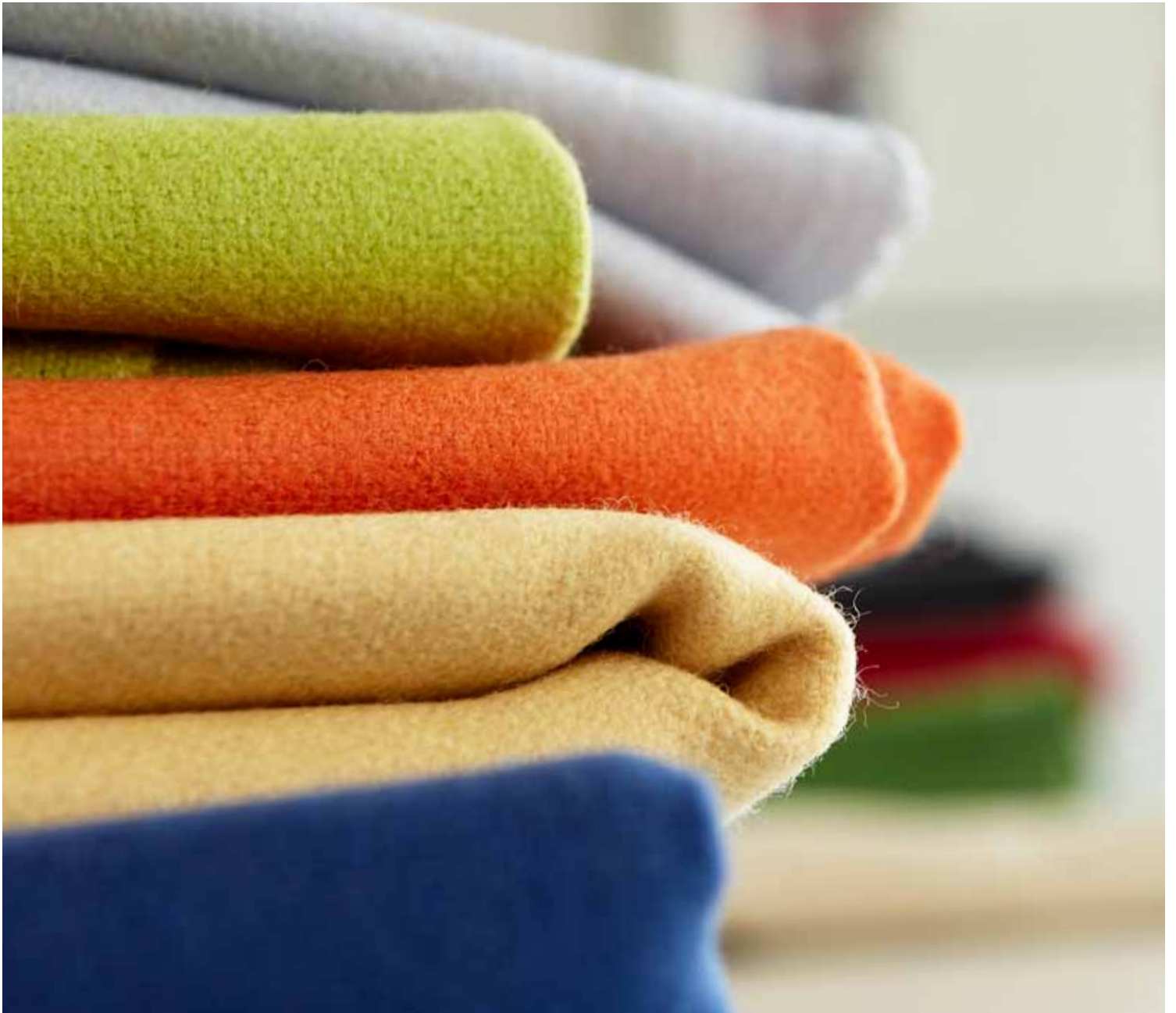
Fabrics shown in photo: Gravel 5G84, Firefly 5G78, Marmalade 5G73, Candlelight 5G71 and Blue Bonnet 5G82

100% Wool. 100% Sustainable. 100% Feel Good.