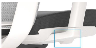
seat slider Pull button to adjust seat slider (forward and back)