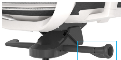
tension adjuster Turn knob to adjust resistance to body weight