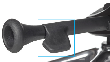
height adjustment Use handle to control height adjustment