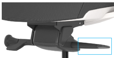
tilt control 2 position locking mechanism