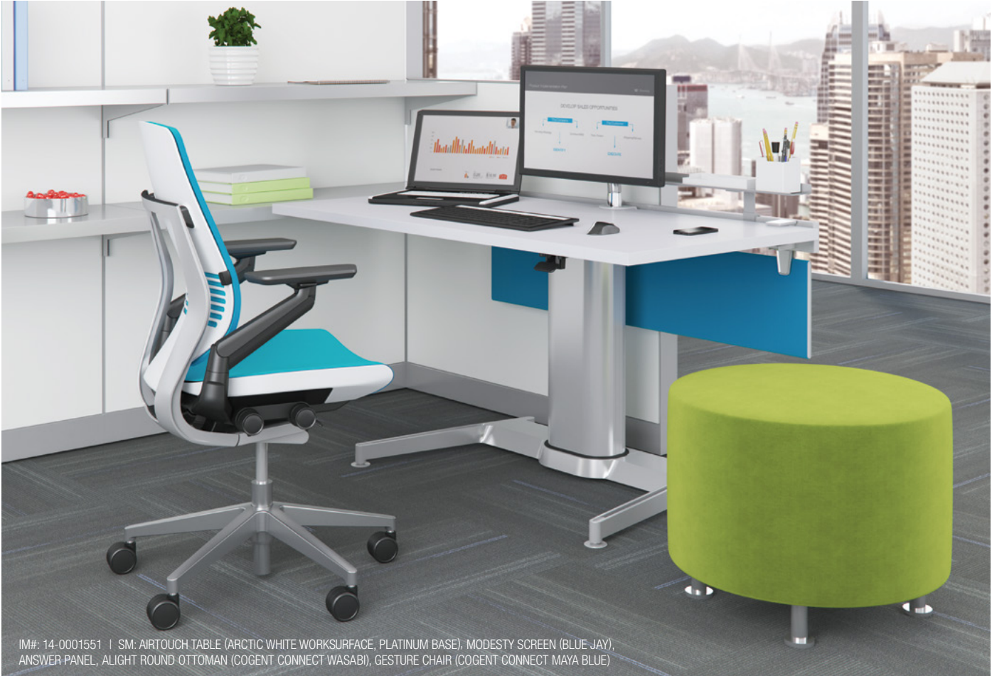
IM#: 14-0001551 | SM: AIRTOUCH TABLE (ARCTIC WHITE WORKSURFACE, PLATINUM BASE), MODESTY SCREEN (BLUE JAY), ANSWER PANEL, ALIGHT ROUND OTTOMAN (COGENT CONNECT WASABI), GESTURE CHAIR (COGENT CONNECT MAYA BLUE)

With its simple and attractive lines, Airtouch, shown above with Answer, works well in any workspace and can be personalized with a variety of products.