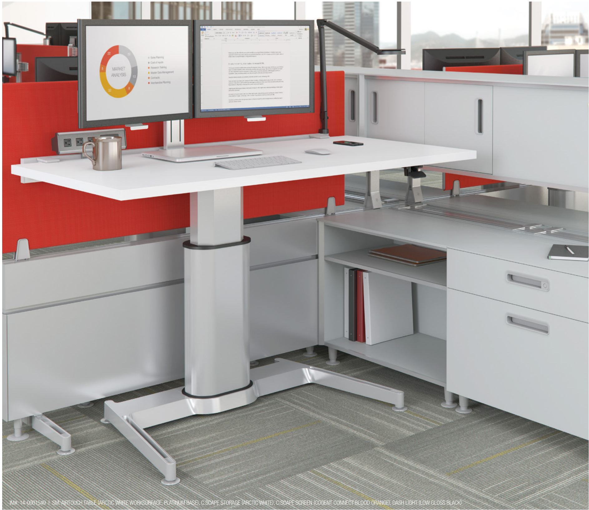
IM#: 14-0001549 | SM: AIRTOUCH TABLE (ARCTIC WHITE WORKSURFACE, PLATINUM BASE), C-SCAPE STORAGE (ARCTIC WHITE), C-SCAPE SCREEN (COGENT CONNECT BLOOD ORANGE), DASH LIGHT (LOW GLOSS BLACK)