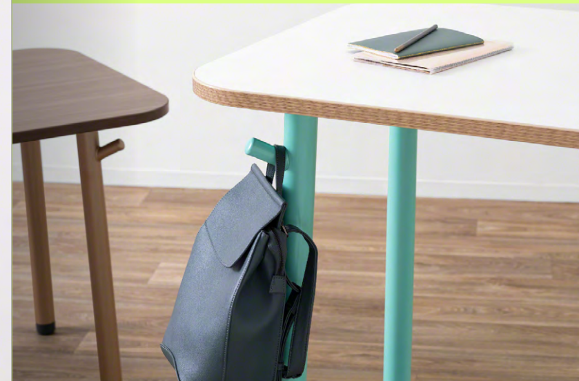
Accessories Details like the pegs on tables provide a place to hang your backpack. Other accessories like baskets and cups give the team a place to keep their things.