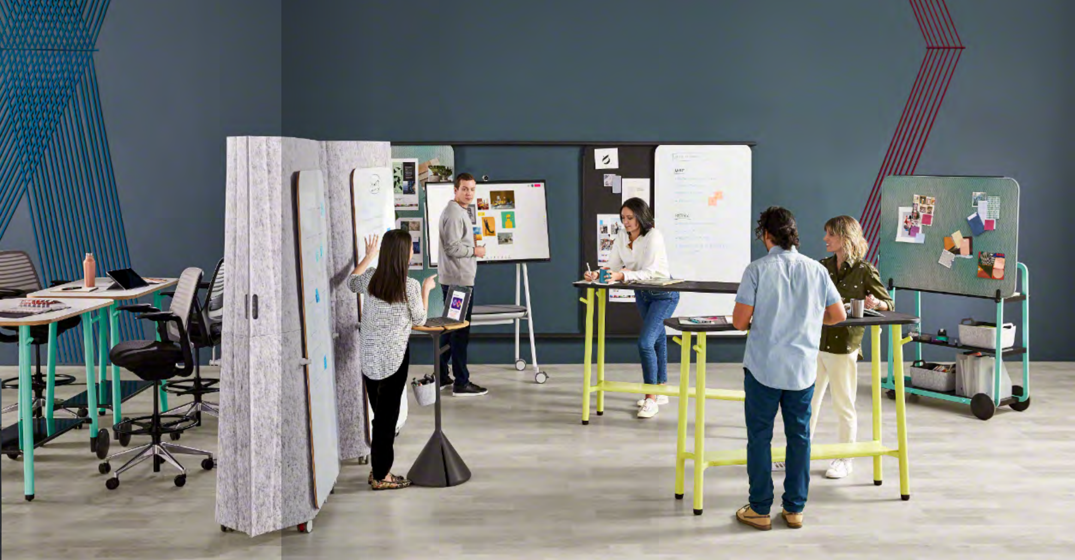
Fuel ideas with a space created to encourage participation for a productive brainstorming session. Slim tables (center) support a standing posture and the team cart (right) includes clips to hold a markerboard or screen, as well as group necessities, such as sticky notes, dry erase markers, paper clips, in the baskets made to fit underneath the display.