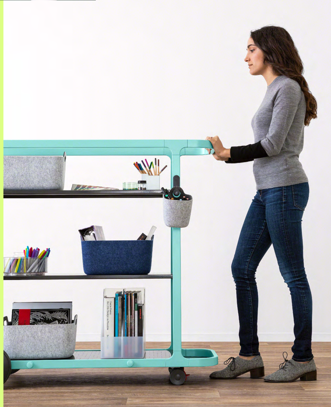
Carts The cart family provides team personalization and storage, a place to display information while also creating boundaries for space division. Designed for mobility, the team cart and board cart keeps all the team's essentials accessible and visible.