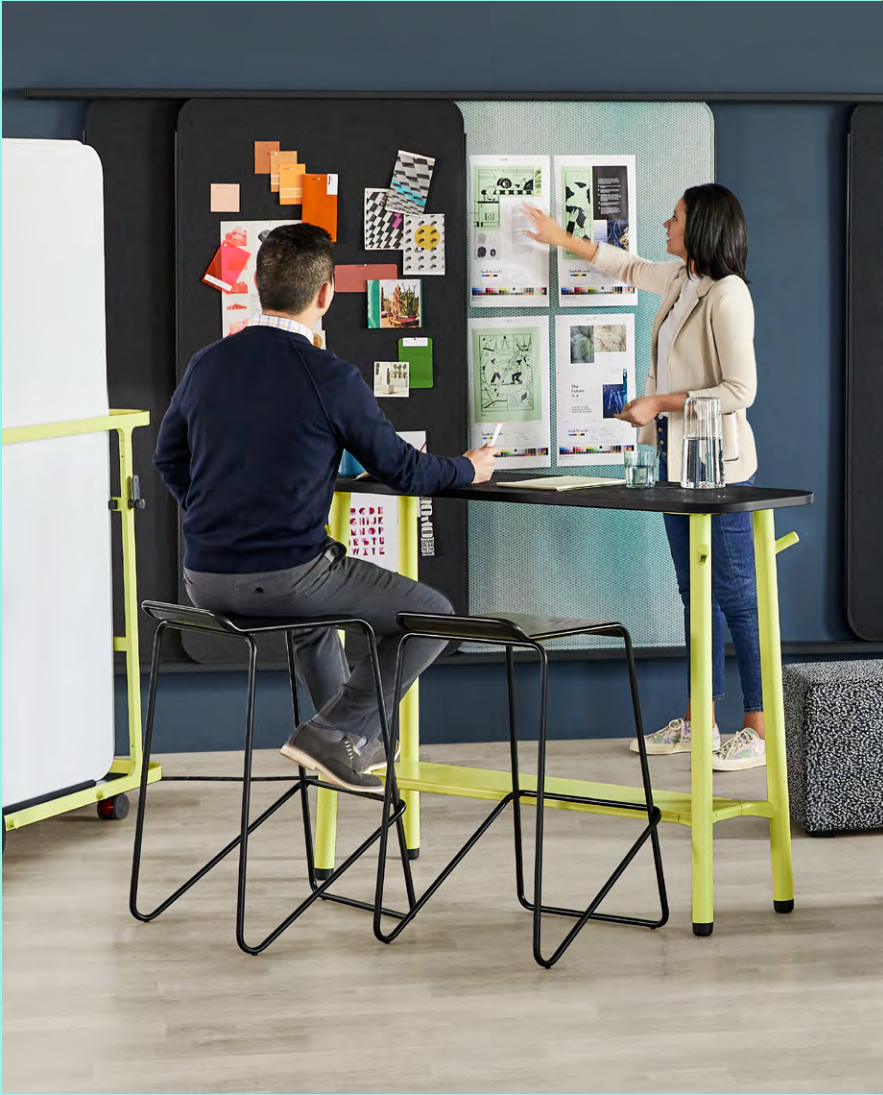
Visual displays help this magazine design team pitch and share an upcoming layout to their leader. The Steelcase Flex Board Cart lets the team bring the collection's markerboards anywhere and the wall rail and stand support visual displays.

Teams practicing design thinking deeply immerse themselves with a problem to develop empathy and an understanding of the customer. They must surround themselves with their information and look for patterns that will point to new needs. They work together to build on each other's ideas and break apart to analyze, synthesize and generate a fresh point of view to bring back to the team. Steelcase Flex Collection supports their ebb and flow between individual work and teamwork.