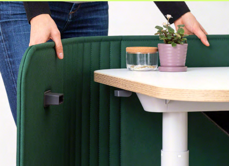
Screens User-adjustable curved screens can be configured by anyone for both privacy and modesty.