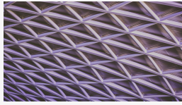
Aubergine is a subtle, sophisticated and tinted neutral.

In today's workplace, people are seeking places that make them feel happy, comfortable or inspired. Demands are higher because people are spending more time with technology and working longer hours. They're also growing more sophisticated in what they like as a result of what they experience through technology and social media. More than ever, it's the perfect time to add more color choices for workplace designers.