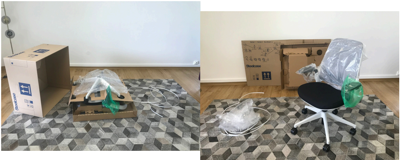
The Series 1™ chair with CarbonNeutral® product certification with protective plastic wrapping.

Customers benefit with faster unpacking during install and quicker clean up, more space efficiency and lower disposal costs.