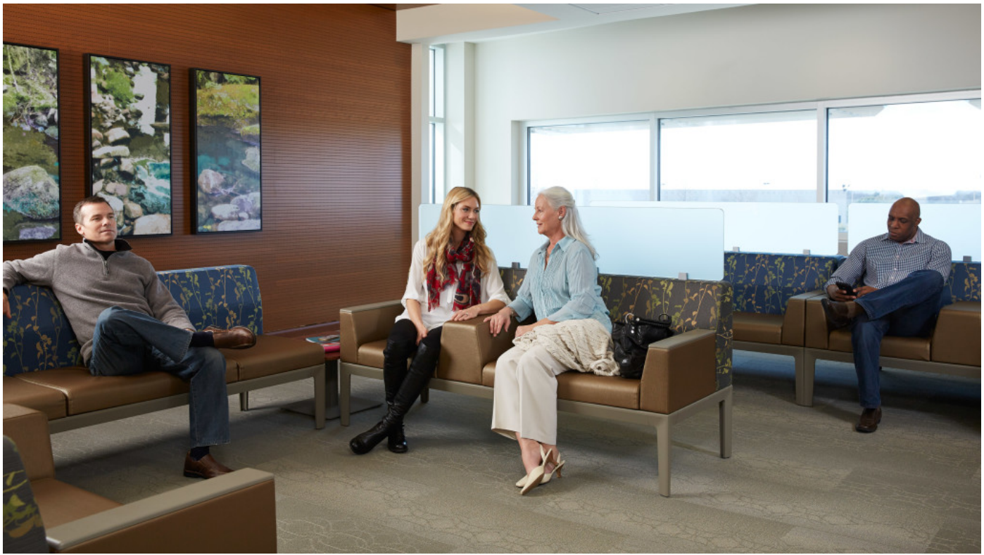
"Our new waiting rooms are by far one of the best features of our new hospital."