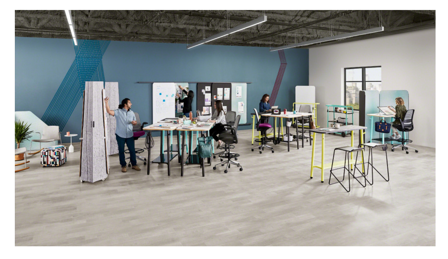
VANJA MISIC | User Experience Lead, Steelcase WorkSpace Futures

"A lot of environments today throw everyone into the same general space and say 'collaborate.' And, we're surprised when it doesn't work and people feel frustrated. Teams do not have the control they need to move easily from activity to activity. They don't have the ability to reconfigure their space at will if their team make-up, needs or priorities change."