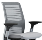
Arms (Fixed, 1D, 4D, Armless)