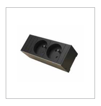
Basic with 2 power sockets EURO plug with French / Belgium and Schuko sockets, Swiss sockets and UK sockets)