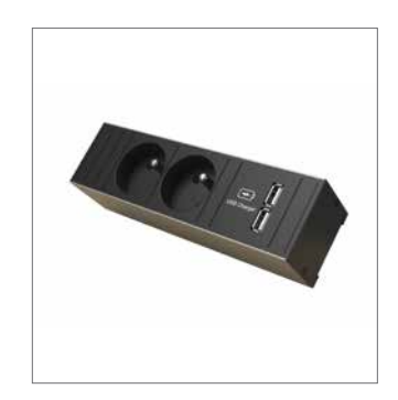
2 Power sockets + 2 USB ports