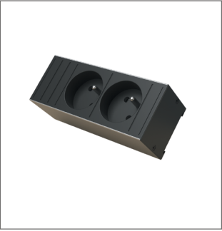
Basic with 2 power sockets EURO plug with French / Belgium and Schuko sockets, Swiss sockets and UK sockets)