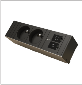
2 Power sockets + 2 USB ports