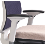
Arms (Fixed, 1D, 3D, 4D, Armless)