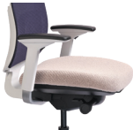
Seat Angle Adjustment