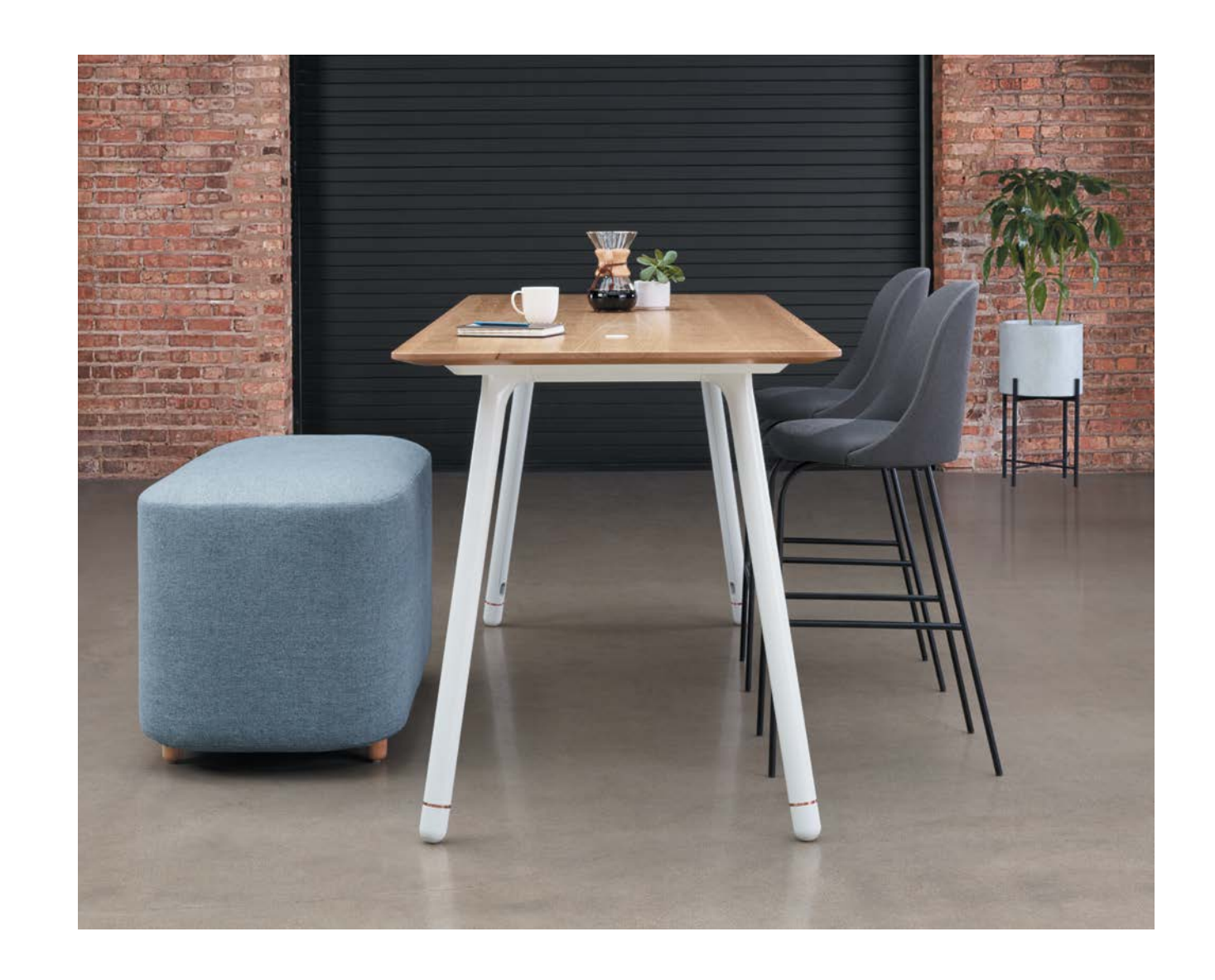
Create a natural palette with solid oak legs.