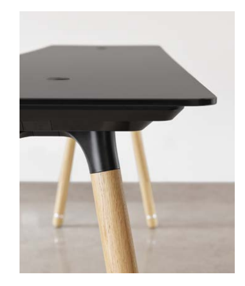
— Choose laminate, veneer, Fenix or glass top materials.

Make your mark with distinct design details — rich top and leg materials, and leg rings. Wood legs bring quintessential warmth and character to enhance a workspace and evoke positive emotional connections.