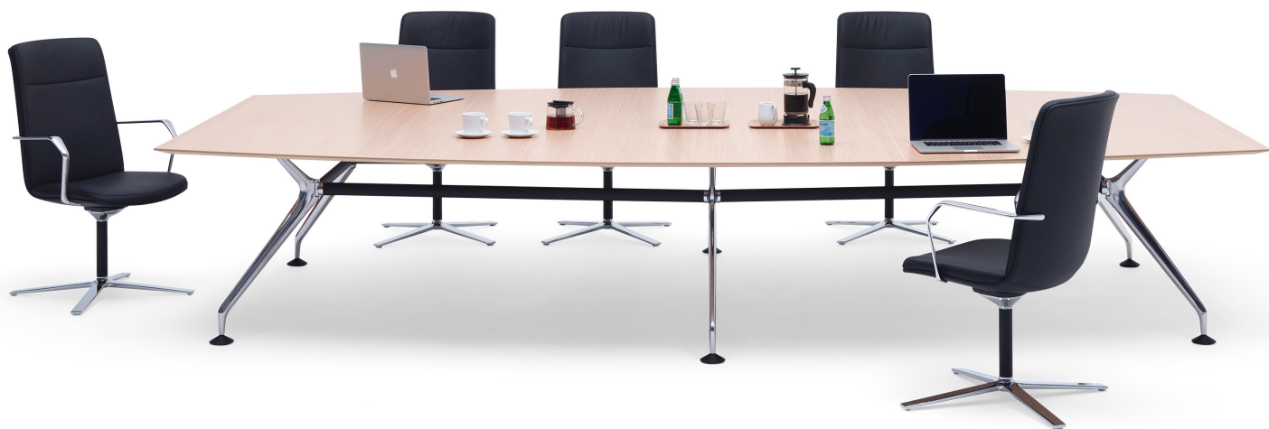
Top – CALDER-MBS4, Bottom – CALDER-HBS