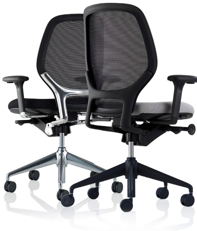
Top – ARA-MBA & ARA-EBA, Bottom – ARA-MBA