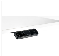
Programmable User Interface