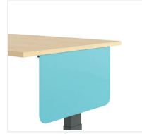
Side Modesty Panel*