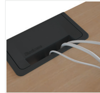
Cable Cut Outs