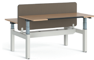
Migration SE H-Bench