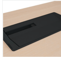
Plastic Top Access