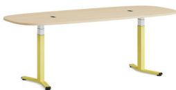
Migration SE Height-Adjustable Meeting Table with T-Leg

The Migration SE Height-Adjustable Meeting Table allows people to easily change postures with a click of a button, offering a flexible meeting experience and fostering increased productivity. It can be used for a wide range of settings within the office such as collaborative, breakout or meeting areas. Settings can be adapted depending on the need of the teams, changing from a traditional conference setting to a stand-up meeting or flexible brainstorming session with the press of a button.