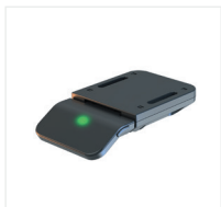
Simple Up / Down Paddle Controller