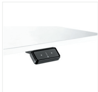
Simple User Interface

Migration SE comes with four different controllers. Two simple controllers (Up/Down and Paddle) and two programmable controllers.