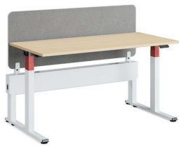
Migration SE Single-Sided Bench