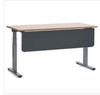
Steel Modesty Panel