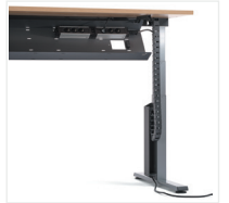
Cable Spine, Chain and Channel