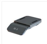
Programmable Paddle Controller