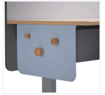
Side Modesty Panel with Wooden Knobs*