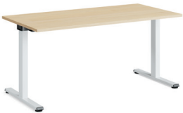
Migration SE Freestanding Desk

The Migration SE height-adjustable desk and bench offer long-term flexibility by easily allowing a desk to convert to a bench, and back again. You can also convert a fixed-height desk to a height adjustable desk with minimal additional parts.