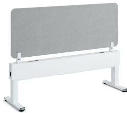
Migration SE Freestanding Fence