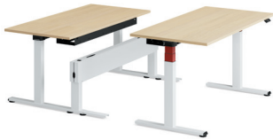
Migration SE Bench with Center Fence