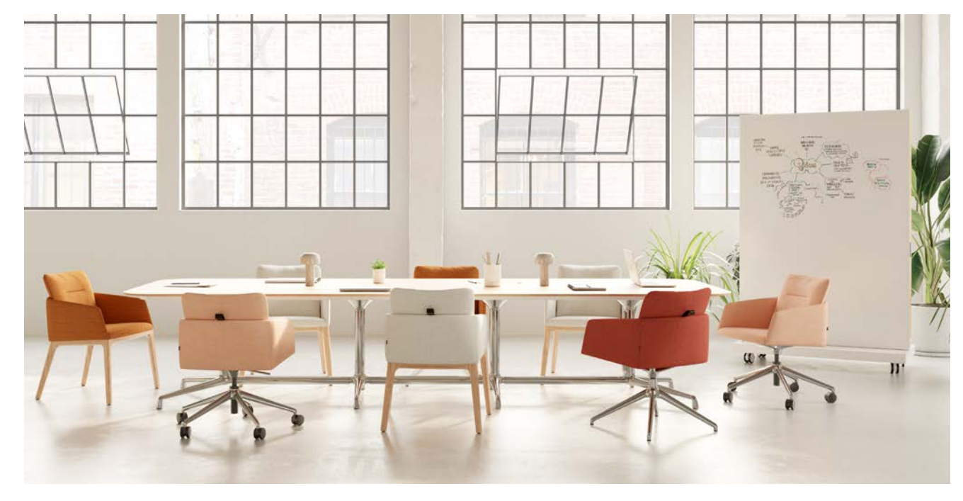
— Mix and match. Beautifully crafted and effortlessly personal, you can create each chair with a mix of upholstery, color, material and base options.