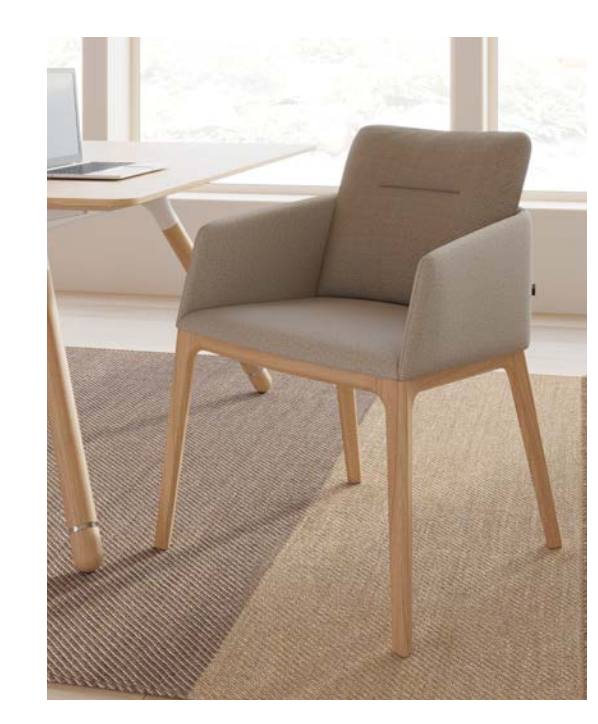
— The collection anchors many applications through the workday, from conference chairs to lounges.

Marien152 is a richly tailored seating experience that's inspired by the home and designed for the workday. Thoughtful comfort is the foundation of a modern residential expression, bringing a surprising level of support together with soft, inviting style across a comprehensive seating family. Design personalization is built into the collection through a wide range of color, base and materiality choices.