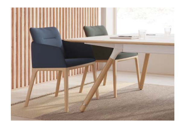
An innovative back cushion gives the appearance of a soft, loose pillow, yet has subtle, built-in flex that allows the chair to move comfortably with you.

A cleverly designed back cushion gives the appearance of a soft loose pillow with subtle, built-in flex allowing the chair to move with you. Varied upholstery, color and base options allow you make a statement while carrying Marien152's style through the space plan.