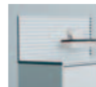
Top with Orga panel