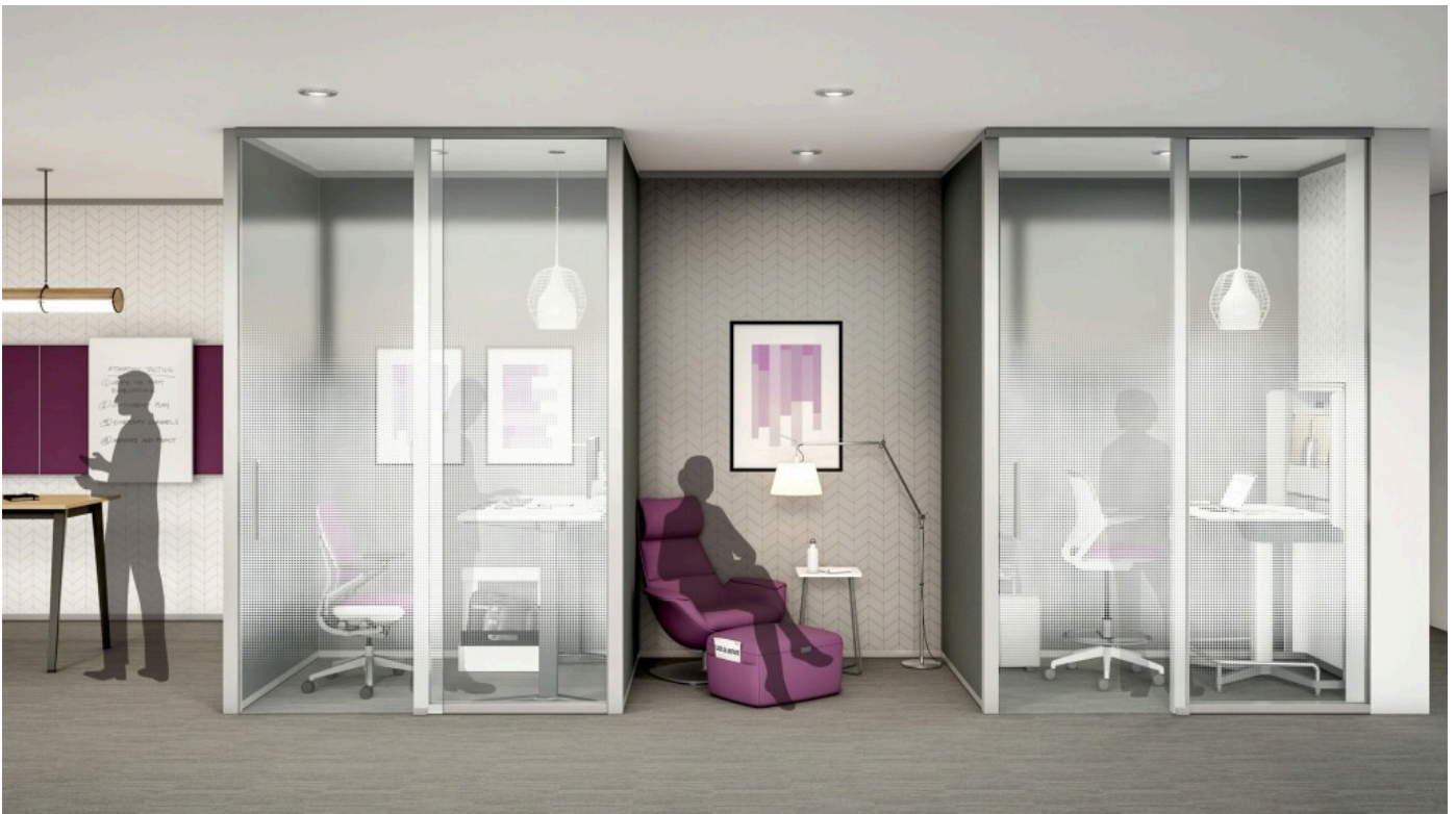
Whiteboards capture information and ideas, reducing cognitive load to encourage creative thinking.