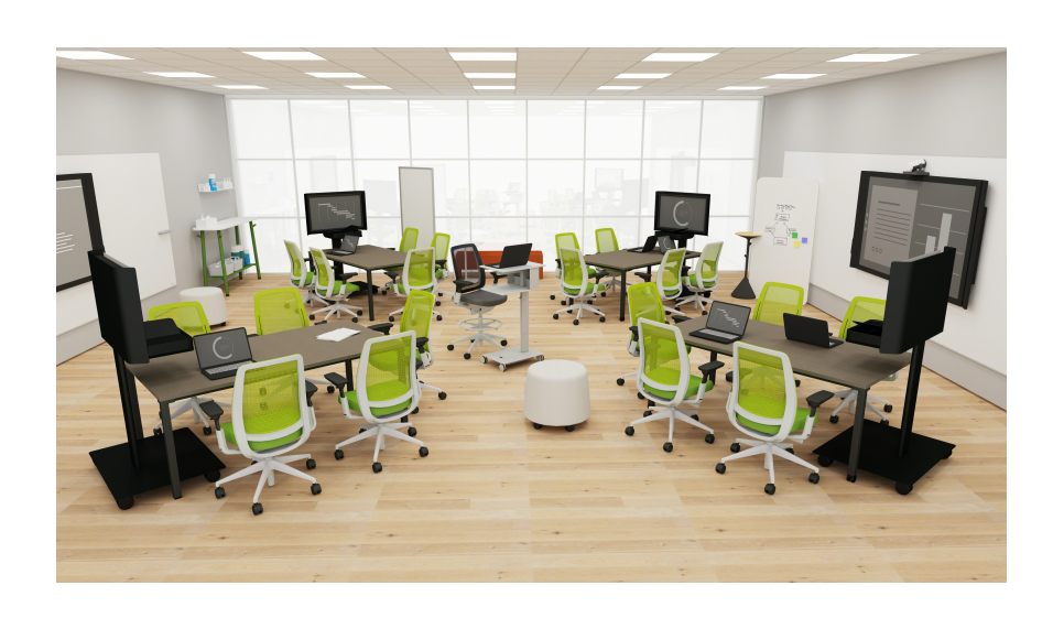
This lab-style classroom is optimized for technology sharing. Triangulation supports sightlines to digital content and allows eye-to-eye interactions.

If students are unable to join in person, remote learners have "presence" through wall displays. Ceiling mounted microphones support acoustics.