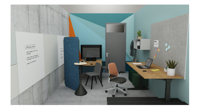
As the demands on faculty increase, the private office is a space where faculty can retreat and rejuvenate.

This thoughtfully-placed acoustic pod provides space and tools to support distance learning and can be used by multiple faculty members.