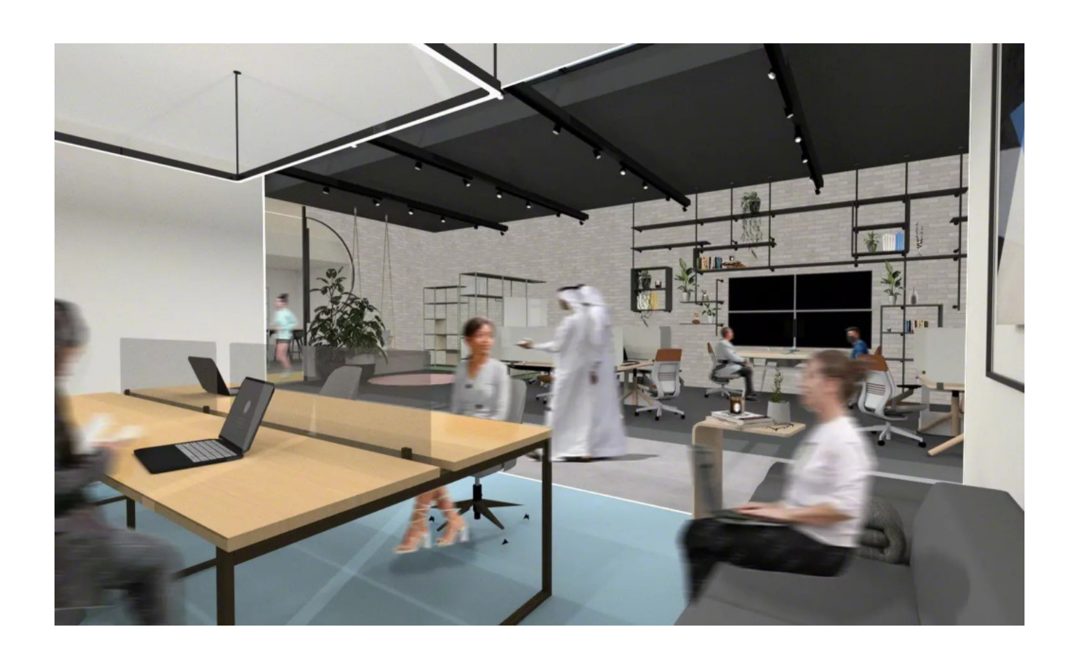
Proposed design by student Raghad AlMulla