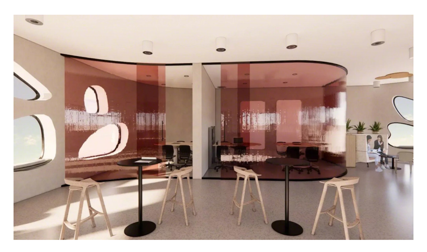
Proposed design by students Ayah Qumber and Nourhan Hassan