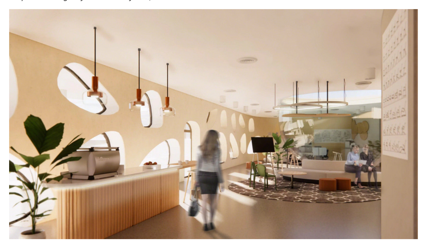
Proposed design by students Ayah Qumber and Nourhan Hassan