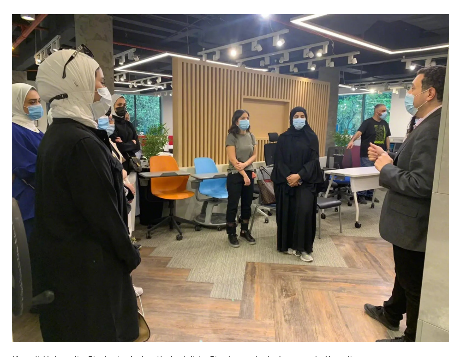
Kuwait University Students during their visit to Steelcase dealer's space in Kuwait