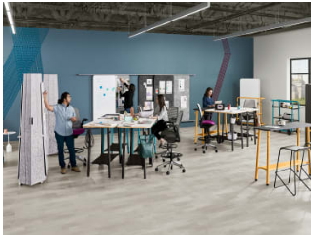
Steelcase Flex Collection