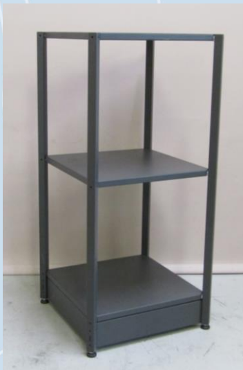
1 wide free standing units are only available up to and including 3 levels high.