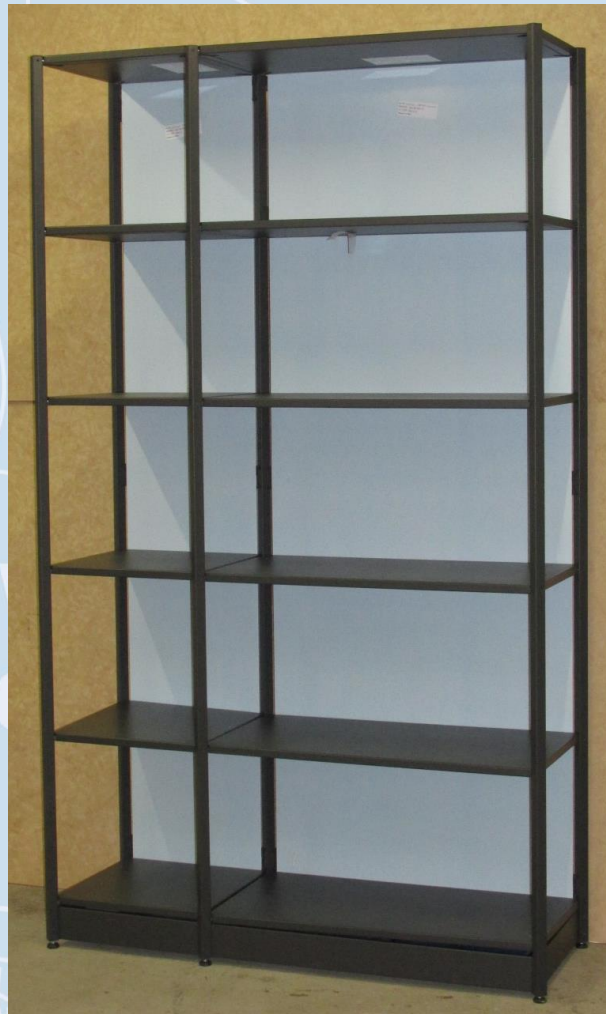
1 wide x 5 high (left end) and 1 wide x 4 high units are only available when attached to another unit, they are no available as free standing units.