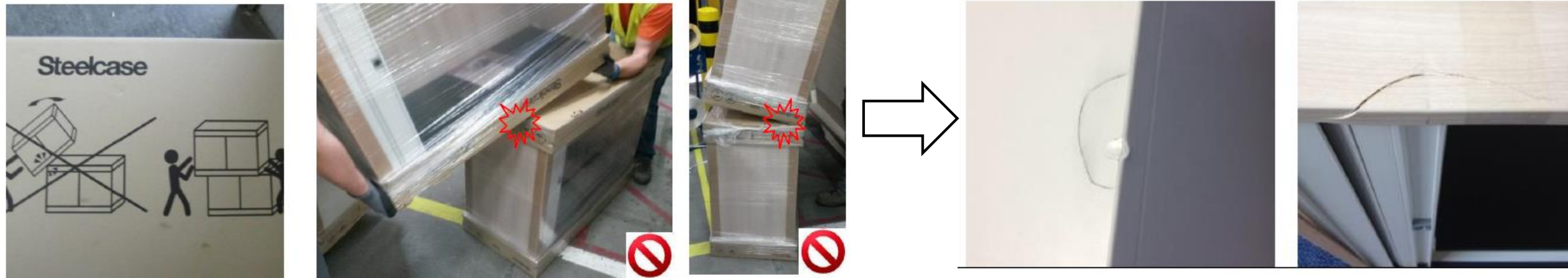
Example of a storage unit damaged by not placing a storage cabinet correctly on another.

ALWAYS watch the corners of storage. Place shipping blankets or cardboard in between to protect corners.