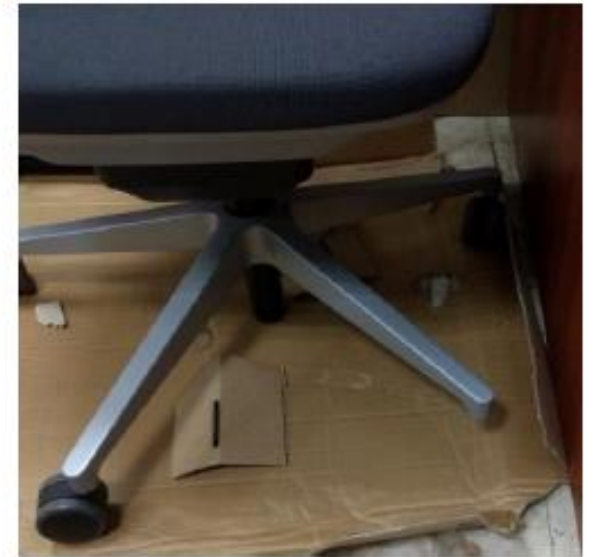
Example of a box that fell down flat. Casters were damaged.