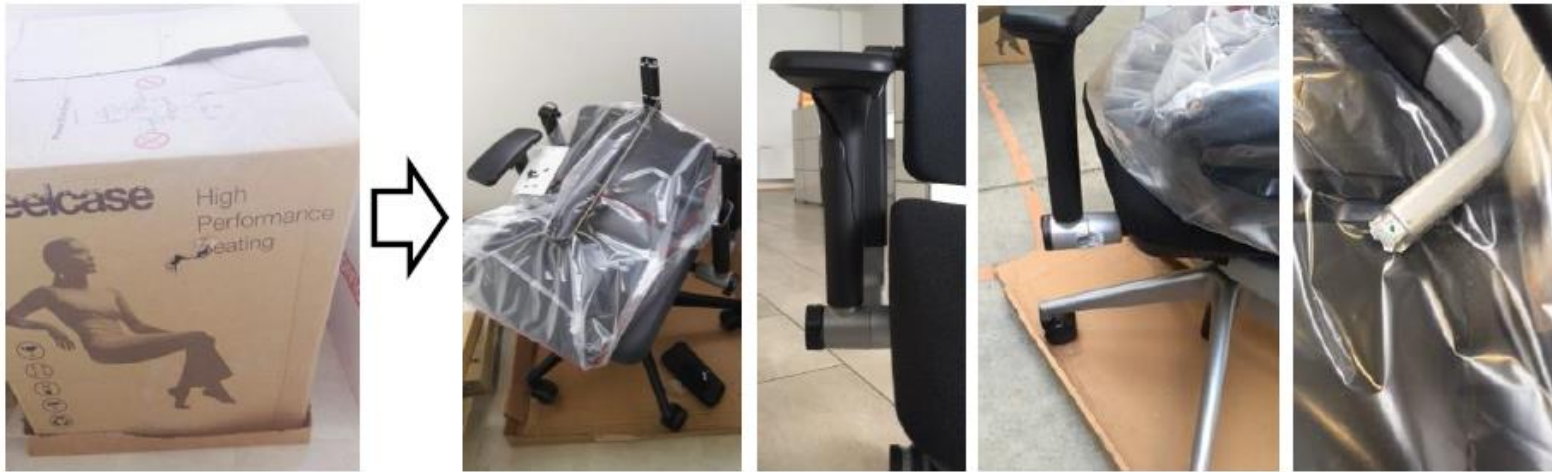
Example of a box that fell down on its side. Arm pad and was damaged.

ALWAYS take care when moving chairs. They are sensitive to shocks. The boxes do not protect from damage caused by dropping them.