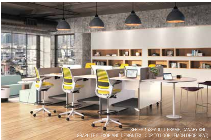
SERIES 1 (SEAGULL FRAME, CANARY KNIT, GRAPHITE FLEXOR AND DESIGNTEX LOOP TO LOOP LEMON DROP SEAT)