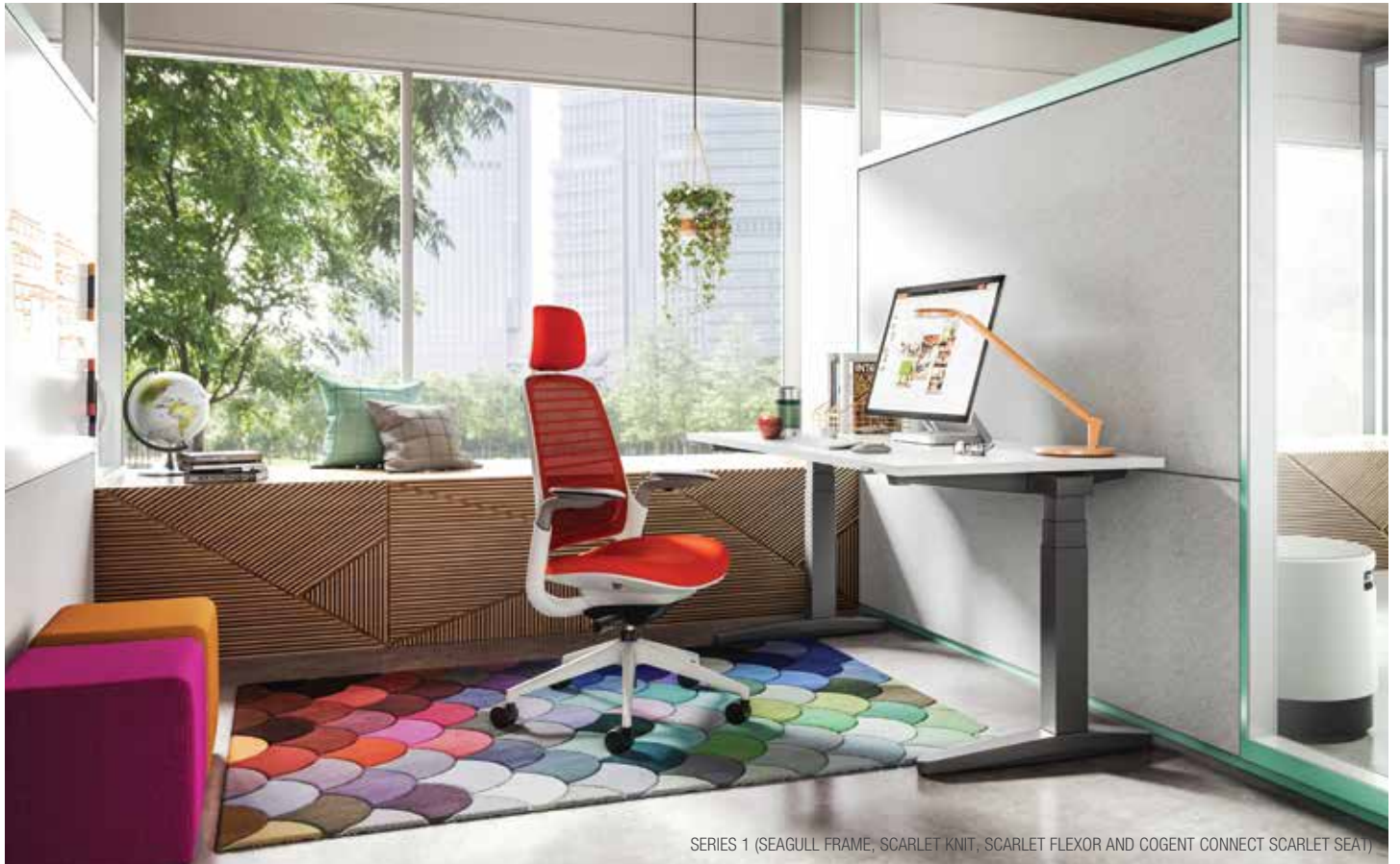
SERIES 1 (SEAGULL FRAME, SCARLET KNIT, SCARLET FLEXOR AND COGENT CONNECT SCARLET SEAT)

Best in class. A new class. By Steelcase.