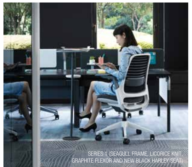
SERIES 1 (SEAGULL FRAME, LICORICE KNIT, GRAPHITE FLEXOR AND NEW BLACK HARLEY SEAT)