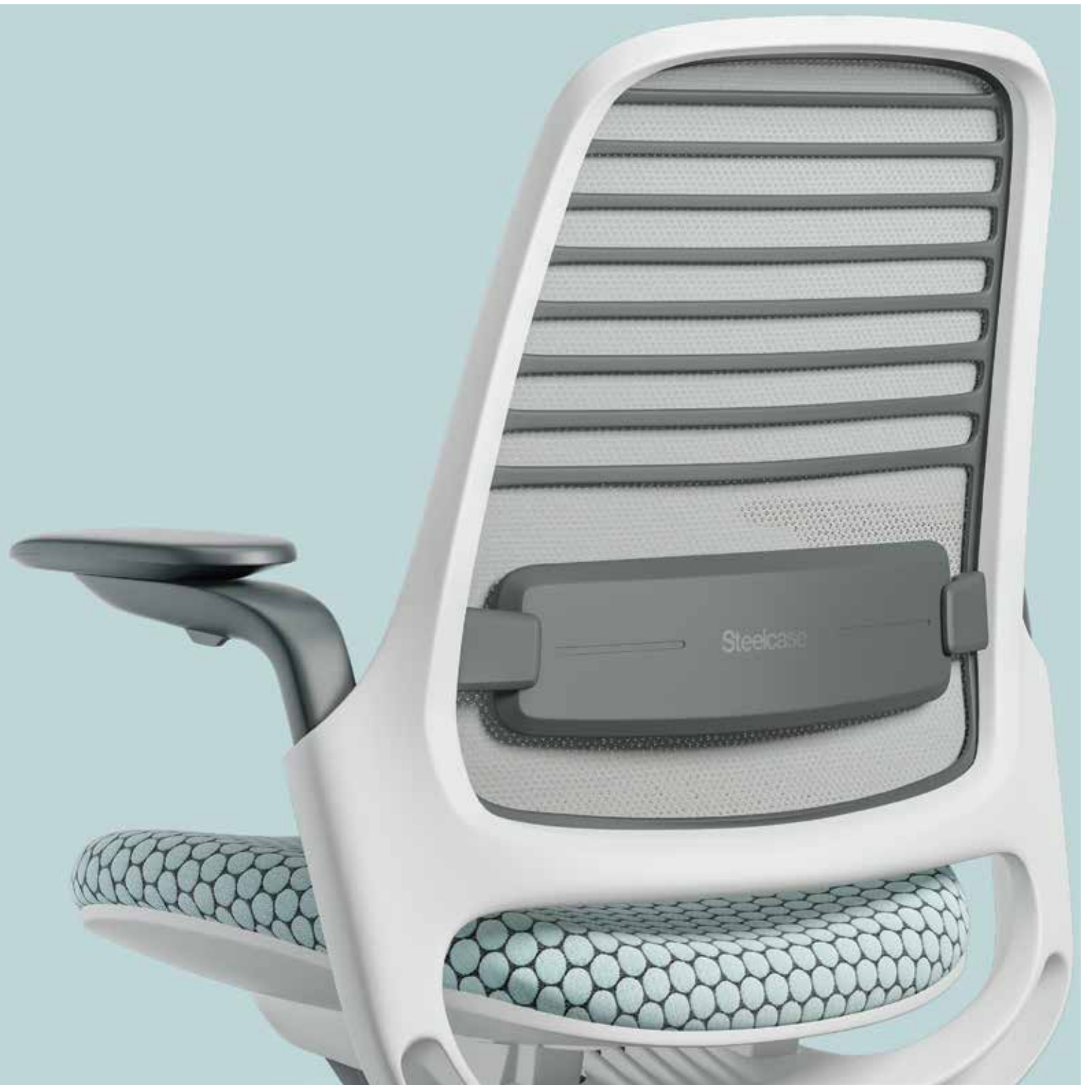
Steelcase Series 1