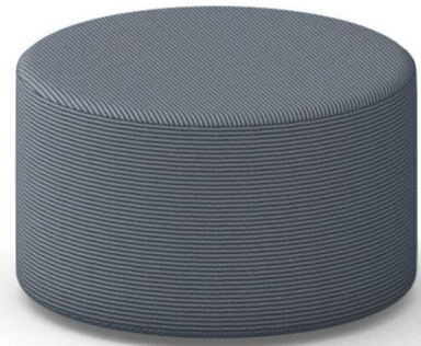
*For illustration purpose only

When we think about work place, we get inspired by experiences of our every day’s life and try to blend them in our work life. All you need to support your work and your forays to higher elevations of innovation is right here. And one of the best things is that you can pick it up and move to a better spot any time you’d like.